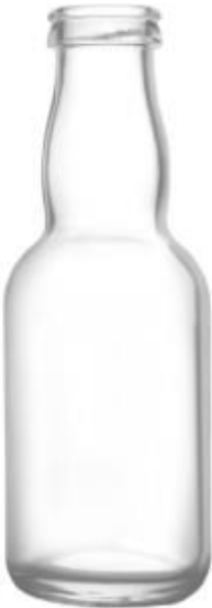
156 ML SAUCE – ES72