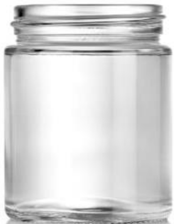
120 ML CLEAR JAR – EB108