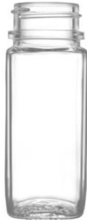
100 GMS SNAPIN – DS108