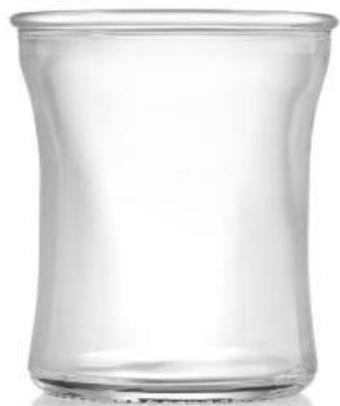
3 OZ CURVE JAR – DB84