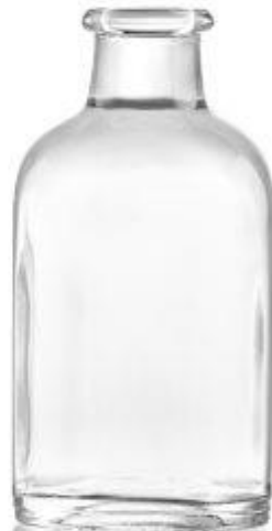
100 ML FRASCA – ES48