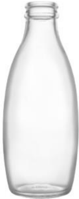
NID – 200 ML MILK BOTTLE