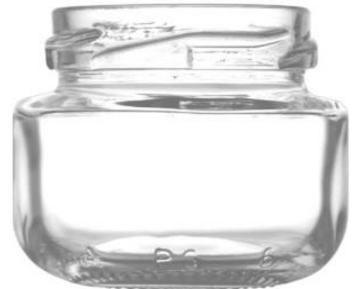
B2 ONJUS JAR – JT390