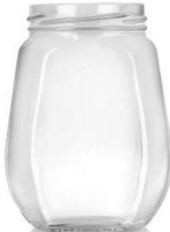
500 ML CROWN HONEY JAR – JT187