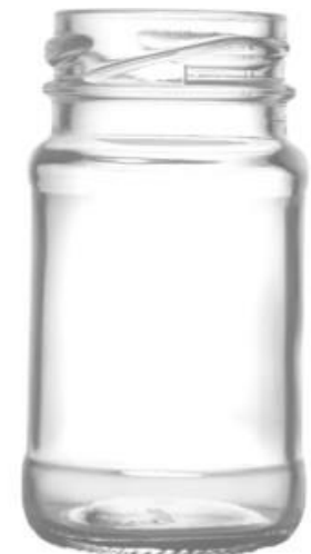
2.5 OZ CYL JAR – JT743