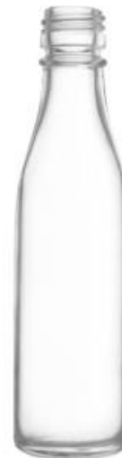
70 ML FRAGRANCE – EB96