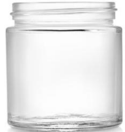
120 ML BQ JAR – EB96