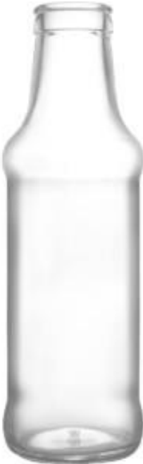
175 ML THIJSENS (6 Layer) – JT481