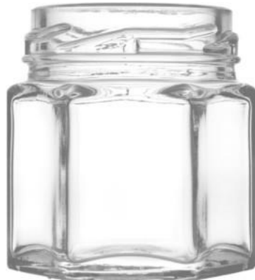
45 ML HEXAGONAL JAR – ES68