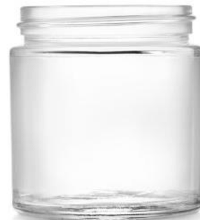
120 ML BQ JAR – EB96