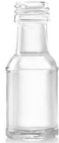
12 ML LION HONEY – DB248