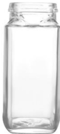
50 GM SQUARE TATA COFFEE JAR – DB70