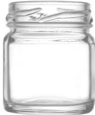
1.5 OZ MINI JAM JAR – ES120