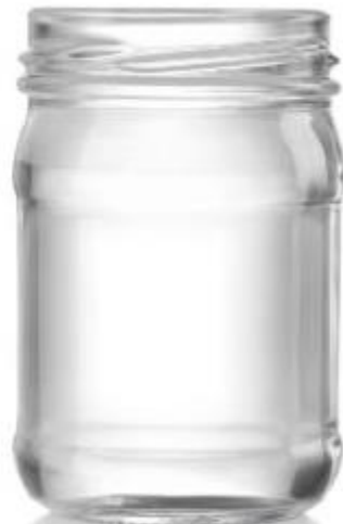
125 ML MASHROOM – DS72