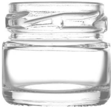
30 ML RDP JAR JT - 702