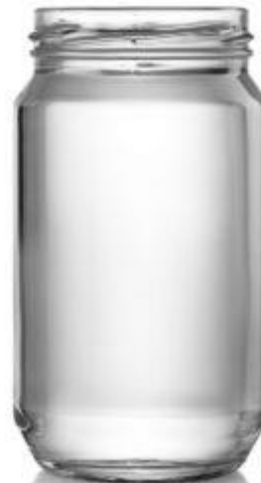
450 GMS JAM JAR – ES28