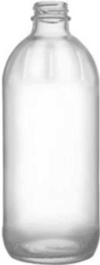
473 ML HOT SAUCE BOTTLE – DB30