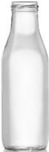
500 ML ROUND MILK BOTTLE CEC – DB30