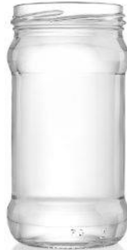
200 GMS T JAR (300 GMS FUDKOR) – DB48