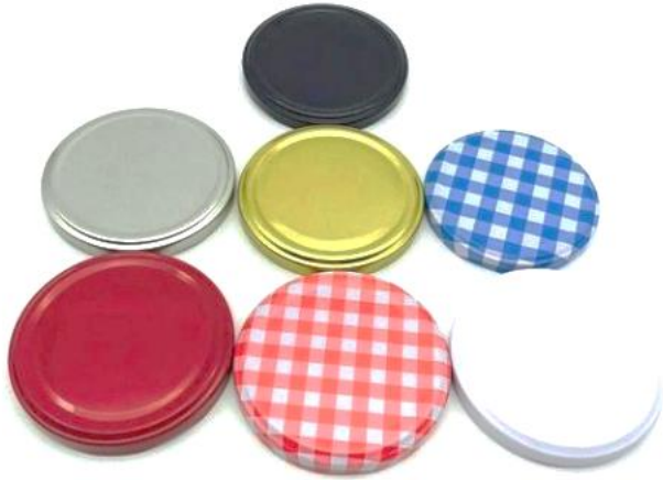
METAL / LUG CAPS