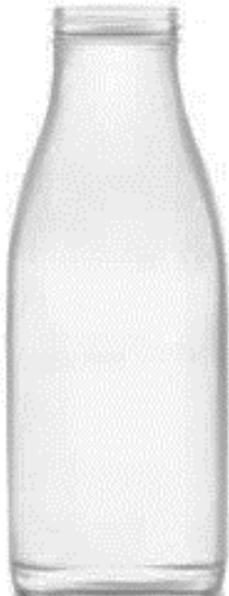
1000 ML ROUND MILK BOTTLE [SC NECK] – DB15