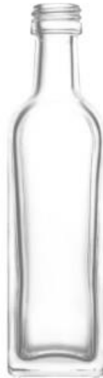
100 ML MARASCA – ES96