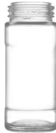
100 ML KEYA SPICE – DS80