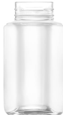
50 GM TRIANGLE (SNAP CLOSE) – DB30