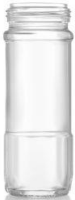
80 ML DIAMOND SPICE JAR – JT627