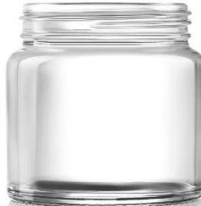
120 GM HG JAR – DS90