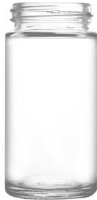
80 ML MONTE SPICE JAR – JT510