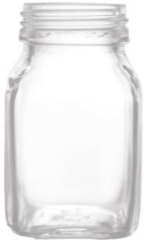
100 GMS HONEY SQUARE – DS80