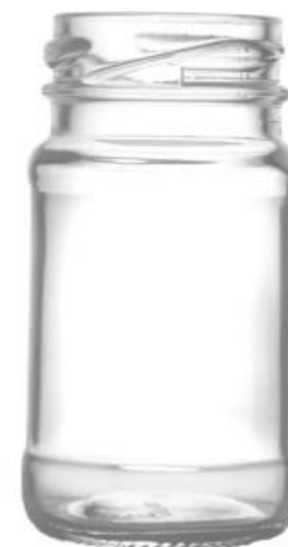
2.5 OZ CYL JAR – JT743