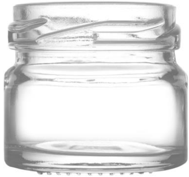
1 OZ (33 ML) ROUND PRESERVE T/O 43-JT702