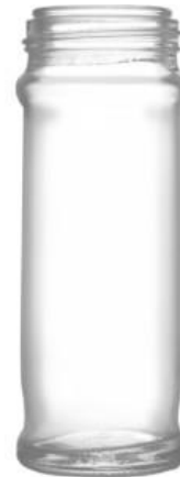
85 ML SPICE JAR – JT578