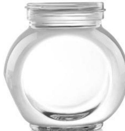
165 GM ZT JAR – EB72