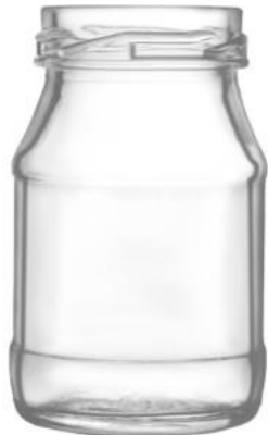
100 ML LION DATES – DS90