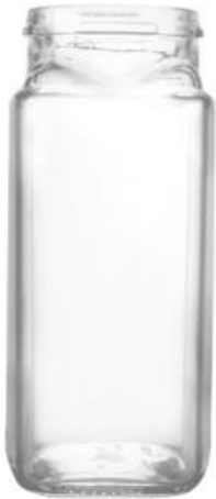
100 GM SQUARE TATA COFFEE JAR – DB28