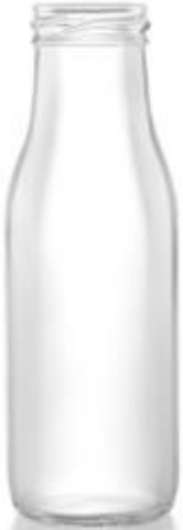
300 ML ROUND MILK BOTTLE CEC – DB48