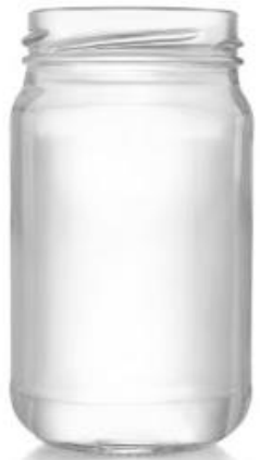
100 GM SARDINES JAR – EB24