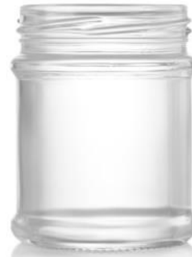
185 ML JAR – 63 LUG – DB70