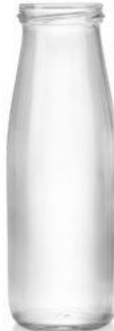
1 LB JAI GLASS – DS42