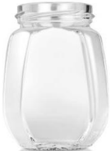
250 ML CROWN HONEY JAR – JT308