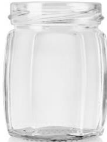
120 ML CROWN HONEY JAR – EB96