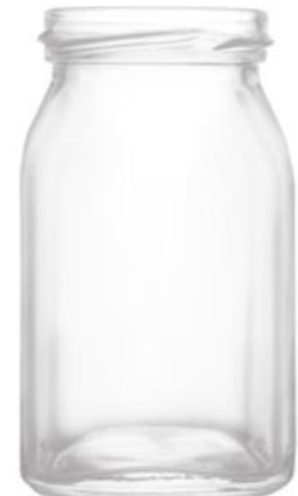
250 GMS HONEY SQUARE PLAIN – DS48