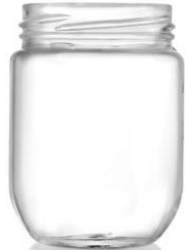
250G TT JAM JAR – ST33