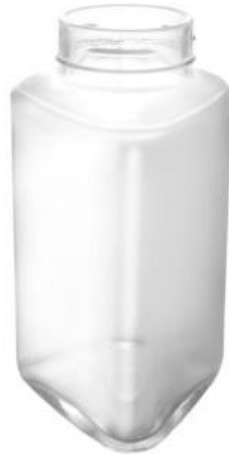
100 GM TRIANGLE – DB20