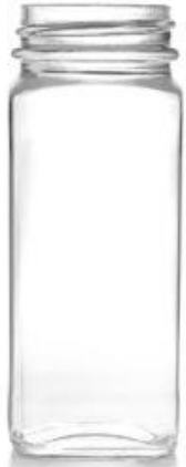
100 GM SQUARE – ST63