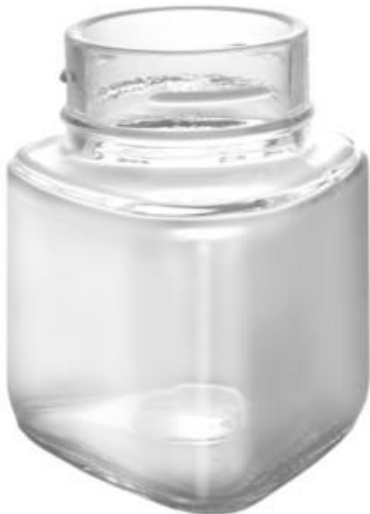
25 GM TRIANGLE – DB60