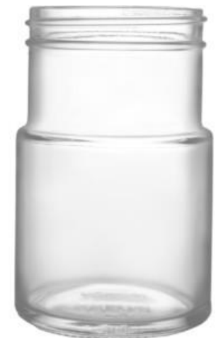
50 GMS COFFEE JAR (AVEON) – DS42