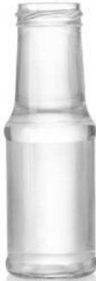
200 ML SOS – DB48