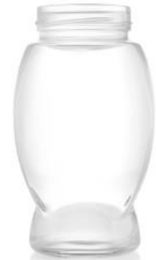
190 GM PRIME COFFEE JAR – DB16