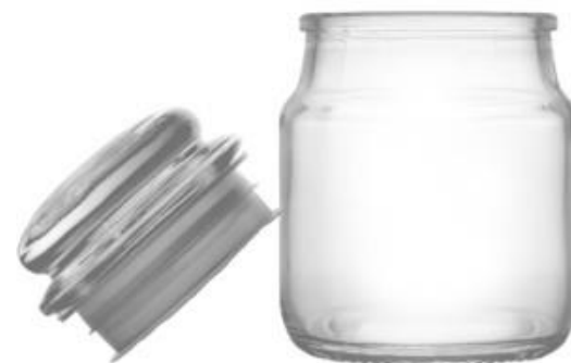
3 OZ CURVE JAR – DB84