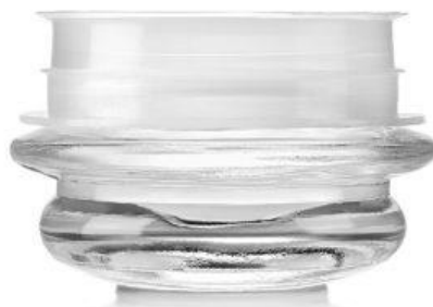
3 OZ CURVE JAR – DB84