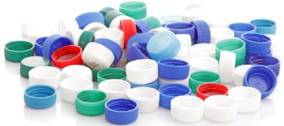
PLASTIC SCREW CAPS