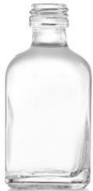
50 ML FRASCA – ES70