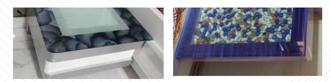
TABLE TOP GLASS

Table top glasses are prepared customised with the edges differently treated like CRYSTAI Edge, Bevel Edge, and Half Round Edge etc. Further to the same the edges can be shaped to suite the design desired. the table tops with different textures, colours and concepts to suite requirements.