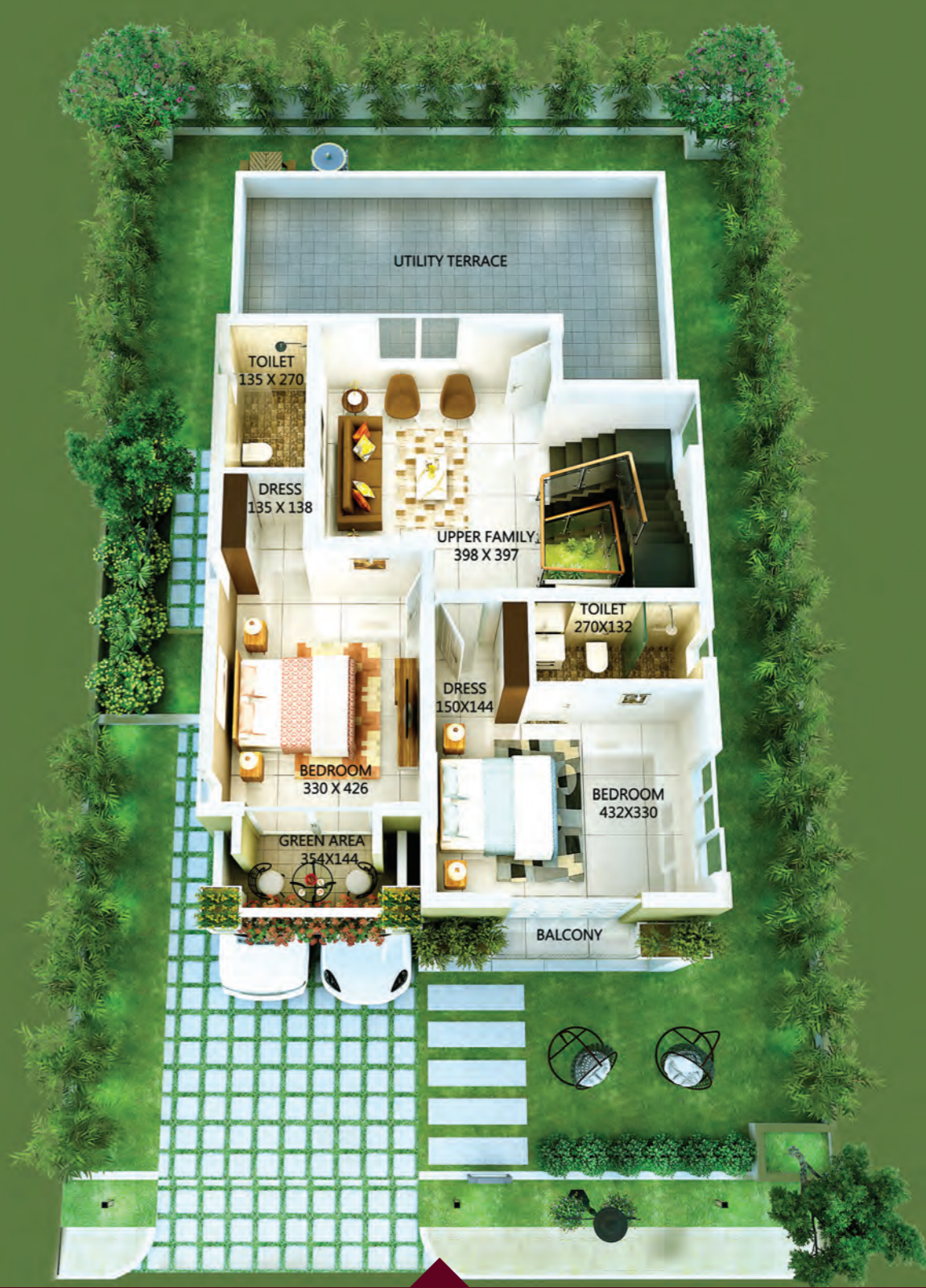
First Floor area : 980 Sqft