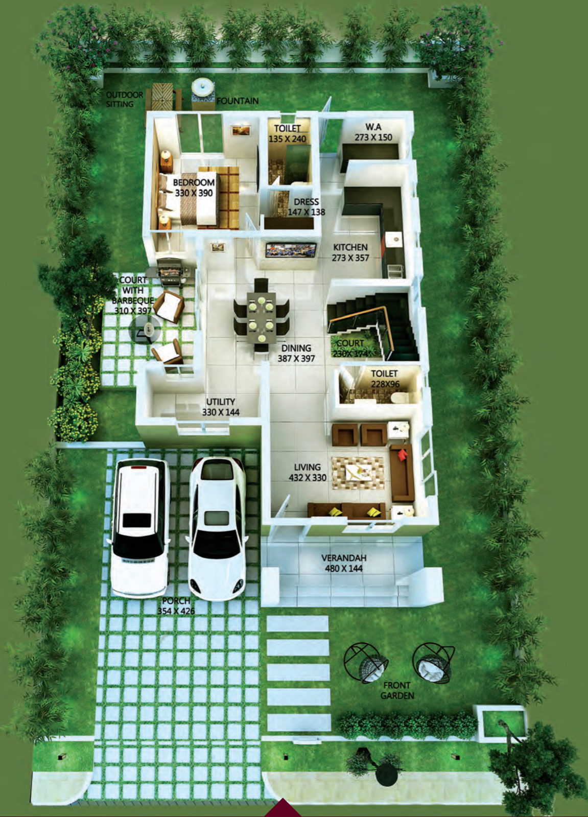
Ground Floor area : 1074 Sqft