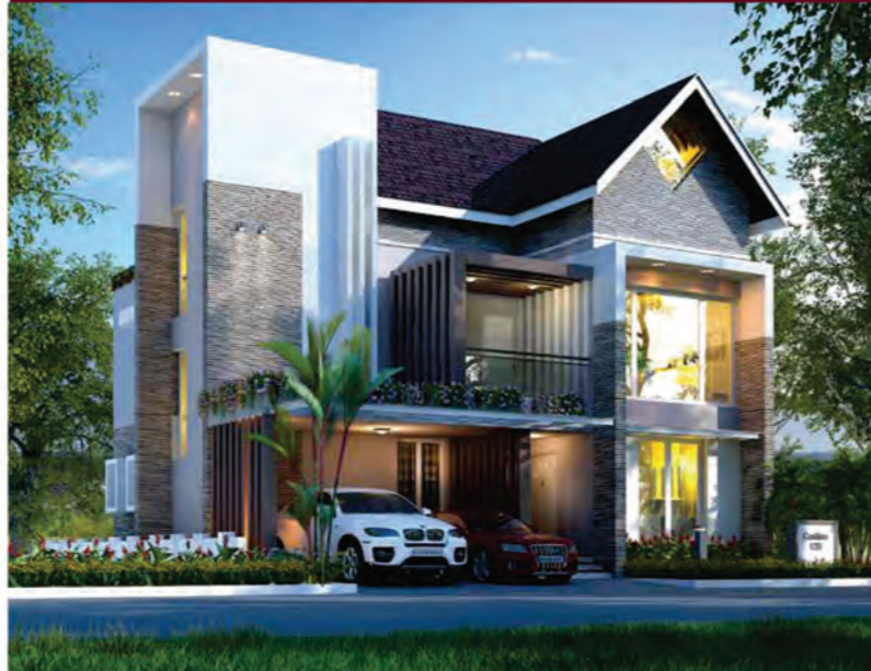
Skylife Infopark Kakkanad