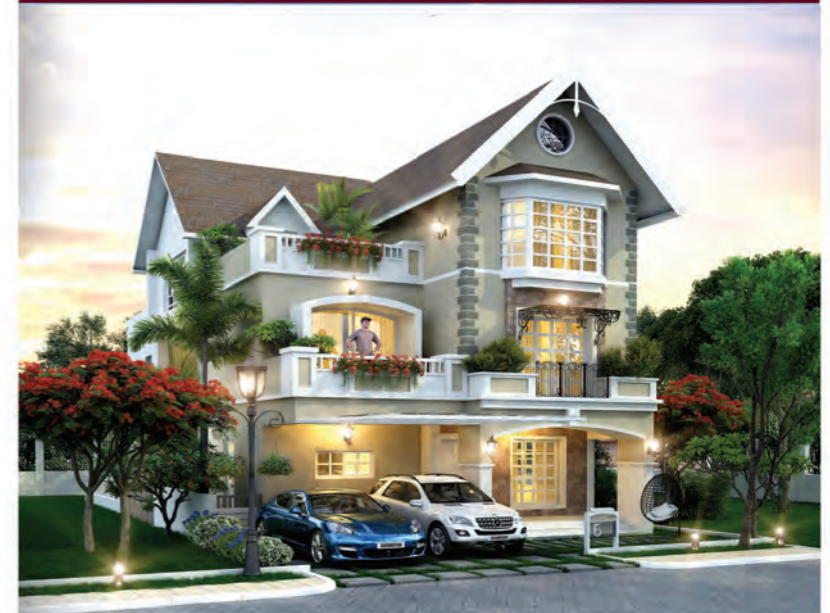
Gardens of Delight Edappally