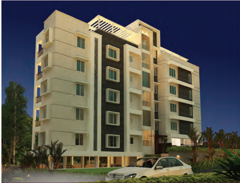
Skyscape Infopark Kakkanad