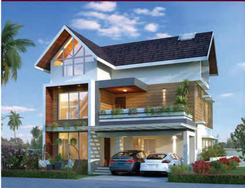
Raindrops Seaport Airport Road, Kakkanad