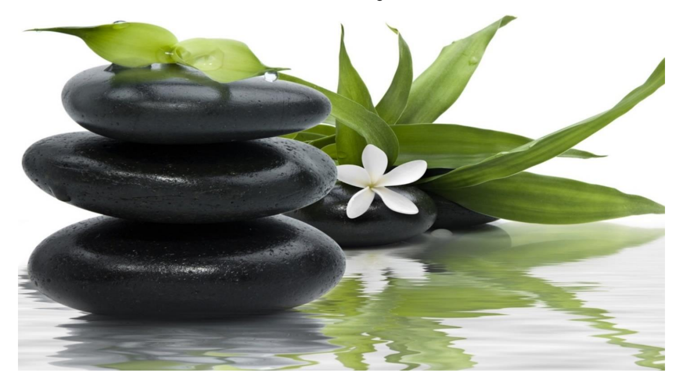
Eden Law Chambers Profile

EDEN LAW CHAMBERS , is both cost effective and time efficient. We are dedicated to develop and maintain long term relationships with our clients and believe that transparency, honesty, responsiveness and personalized service are the keys to quality legal services.