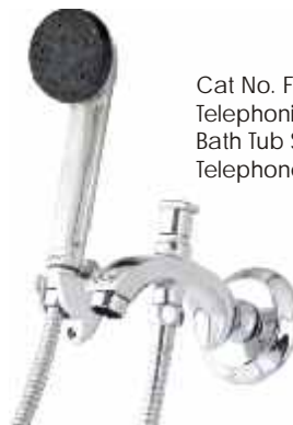
Cat No. FR 1085 + Cat No. FR 1073 Telephonic Shower with 1 m Long Flexible Tube + Bath Tub Spout with Button attachment for Telephone Shower