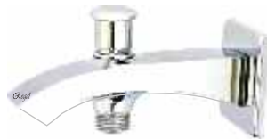
Cat No. LR 5445 C.P. Bath Tub Spout with Button for Telephonic Shower