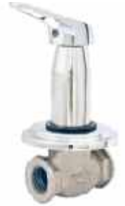
Cat No. FU 1041 Angular Stop Cock with Wall Flange