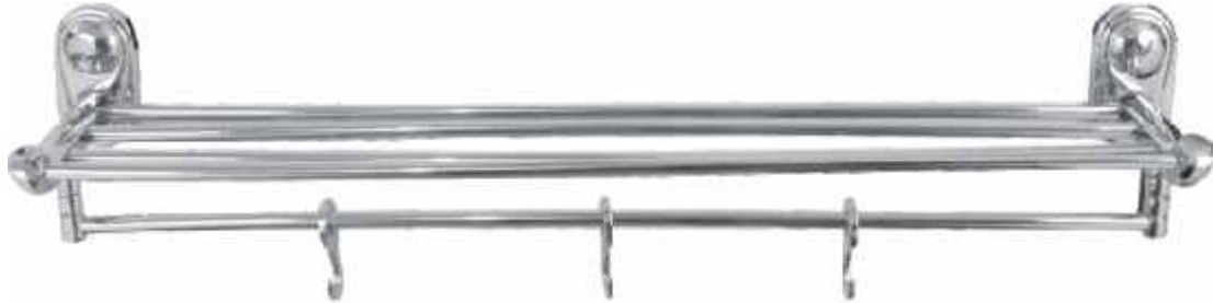
Cat No. AR 3351 Towel Rack 24"