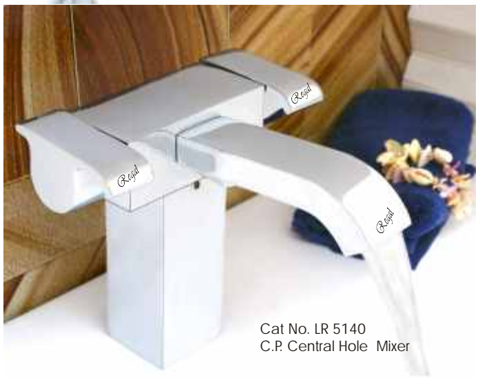
Cat No. LR 5140 C.P. Central Hole Mixer