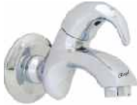
Cat No. F 1021 Bib Cock