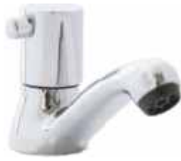
Cat No. ZI 1011 Pillar Cock