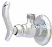
Cat No. 3050 Angular Stop Cock with Wall Flange