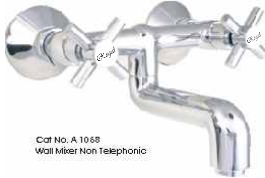
Cat No. A 1068 Wall Mixer Non Telephonic