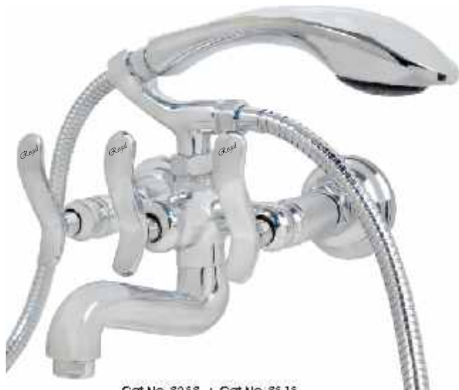
Cat No. 3283 + Cat No. 3818 Wall Mixer with telephonic Shower Arrangement only but with Crutch + Telephonic Shower with 1 & 1/2 m Long flexible Tube