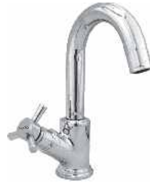
Cat No. 5041 Swan Neck Pillar Cock