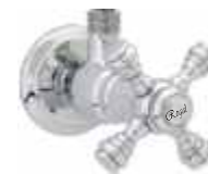
Cat No. 4050 Angle Cock