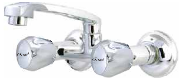
Cat No. 9305 Sink Mixer