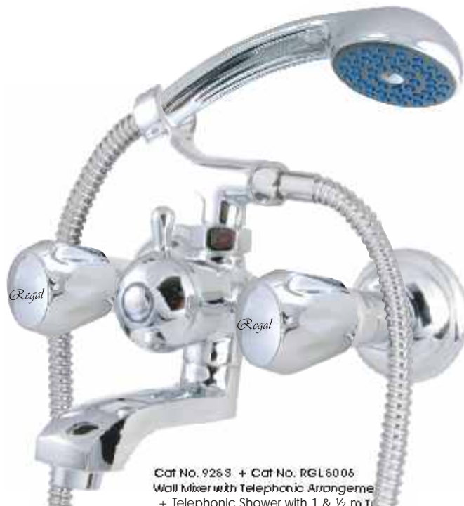
Cat No. 9283 + Cat No. RGL8005 Wall Mixer with Telephonic Arrangement + Telephonic Shower with 1 & 1/2 m T