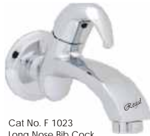
Cat No. F 1023 Long Nose Bib Cock