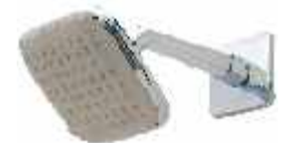
Cat No. AL 5460 + 5462 C.P. Shower Arm and Over Head Shower