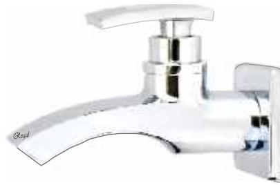
Cat No. AL 5032 C.P. Bib Cock