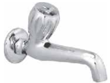
Cat No. E 1028 Long Nose Bib Cock