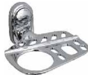
Cat No. AR 3324 Tumbler Holder