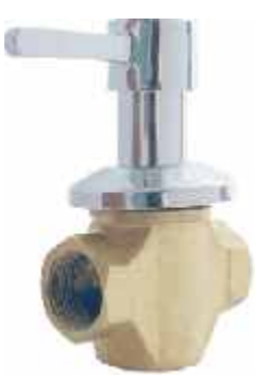
RGL 7002 Flush Cock Lever + push spring loaded 1"