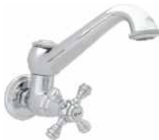
Cat No. 4342 Sink Cock with Swivel Spout