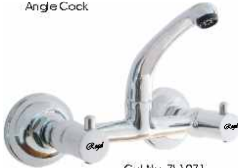
Cat No. ZI 1071 Sink Mixer