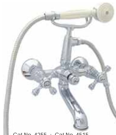
Cat No. 4255 + Cat No. 4515 Wall Mixer with Telephonic Shower Arrangement only but with Crutch + Telephonic Shower with 1 & 1/2 m long Flexible Tube