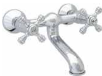
Cat No. 4205 Wall Mixer Non Telephonic