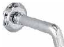
Cat No. 6462 Overhead Shower & Shower Arm Cat No. 6531 Single Lever Concealed Divertor for Bath & Shower System, Cat No. 6428 Bath Tub Spout with Wall Flange