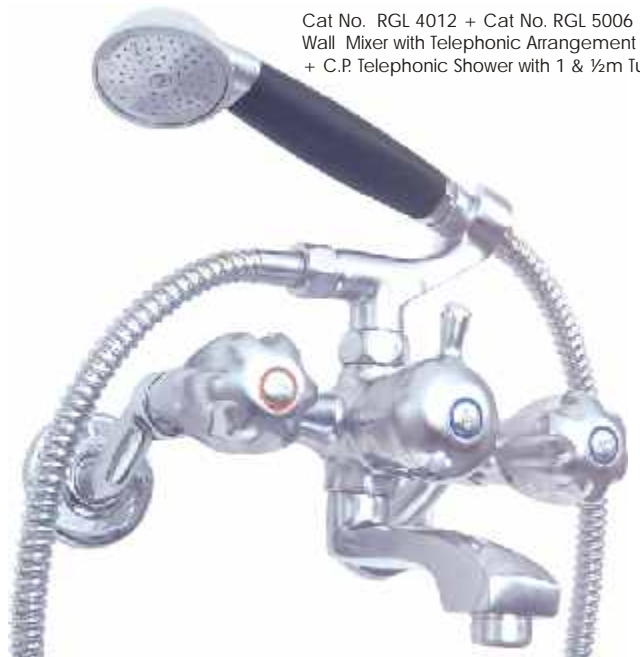
Cat No. RGL 4012 + Cat No. RGL 5006 Wall Mixer with Telephonic Arrangement + C.P. Telephonic Shower with 1 & 1/2m Tube