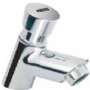
Cat No. AC 025 C.P. Pillar Cock Auto Closing System