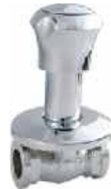
Cat No. Z 1041 Concealed Stop Cock with Sliding flange