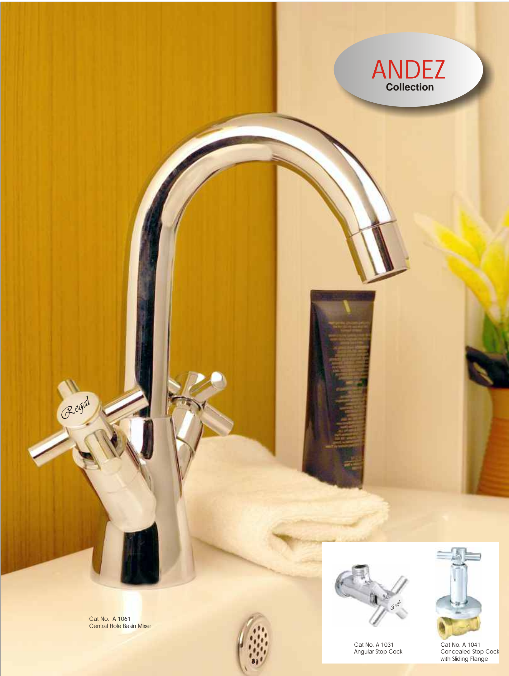
Cat No. A 1061 Central Hole Basin Mixer