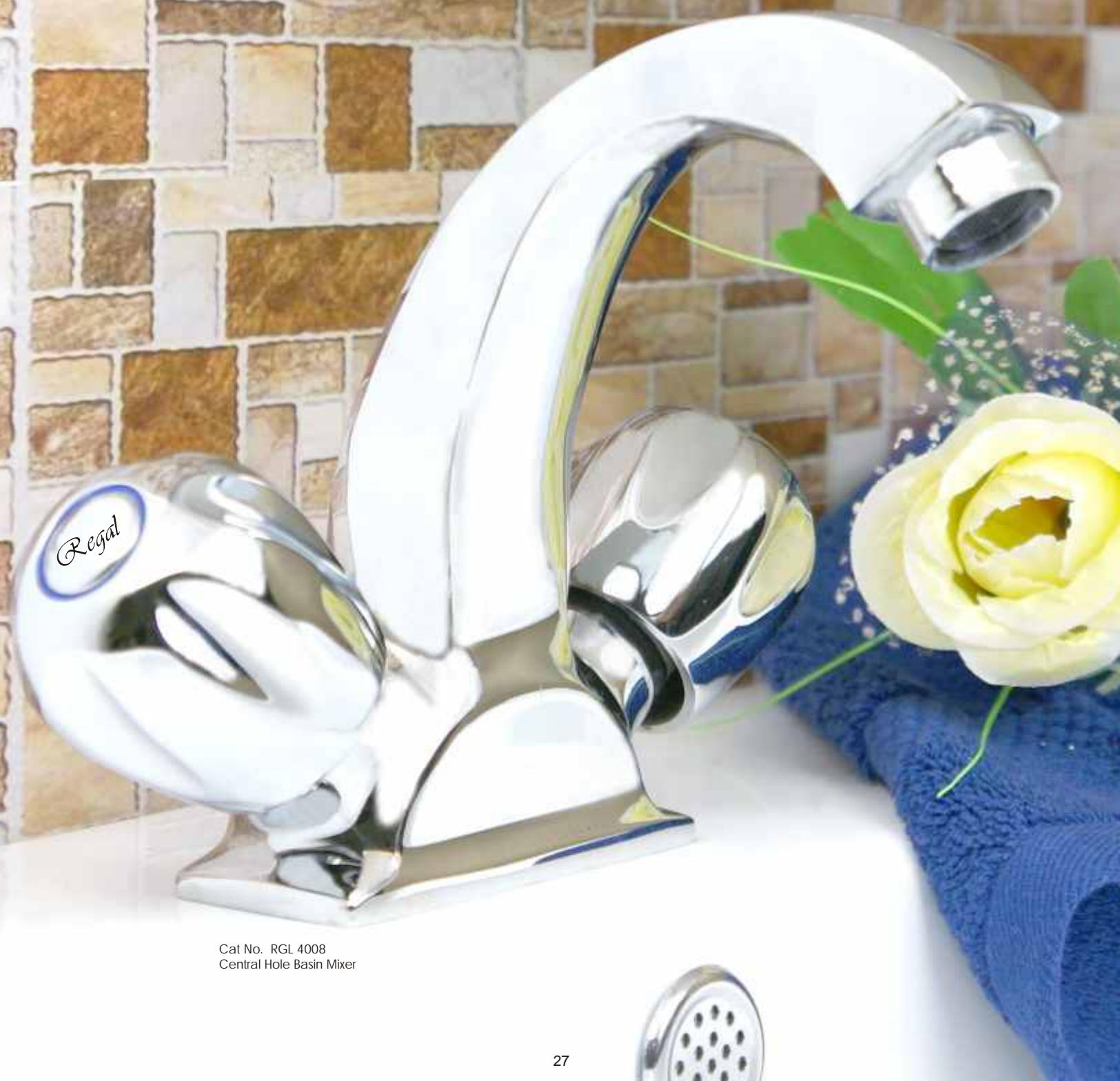
Cat No. RGL 4008 Central Hole Basin Mixer