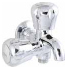
Cat No. 8038 Bib Cock Two Way