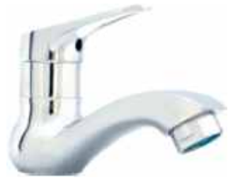
Cat No. FU 1011 Pillar Cock