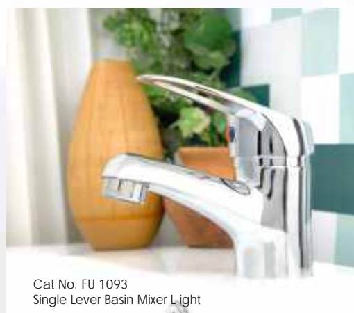
Cat No. FU 1093 Single Lever Basin Mixer Light