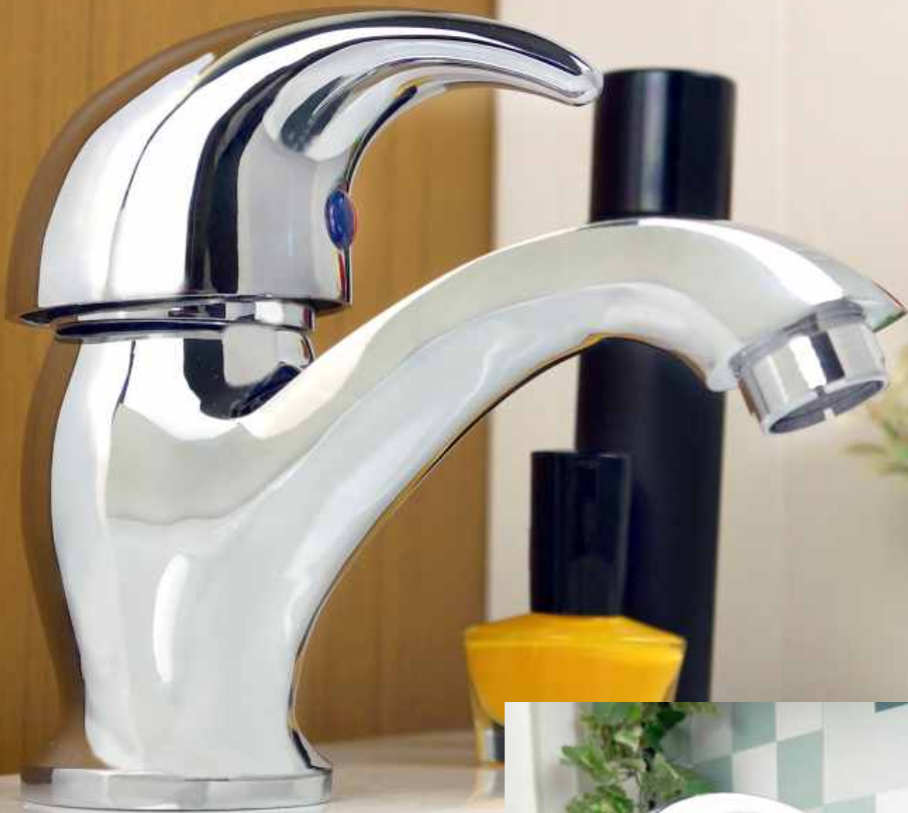
Cat No. F 1091 Single Lever Basin Mixer