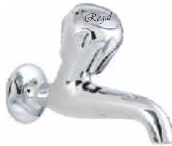
Cat No. 9035 Bib Cock Long Nose