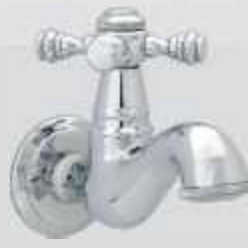
Cat No. 4035 Bib Cock with Wall Flange