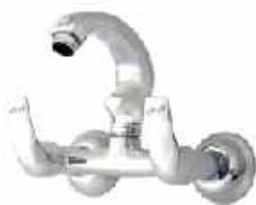
Cat No. FR 1054 C. P. Sink Mixer Swivel Spout