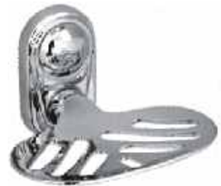
Cat No. AR 3315 Soap Dish