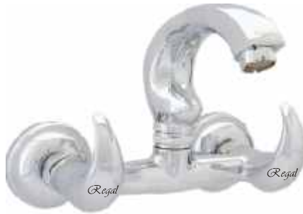
Cat No. F 1055 Sink Mixer