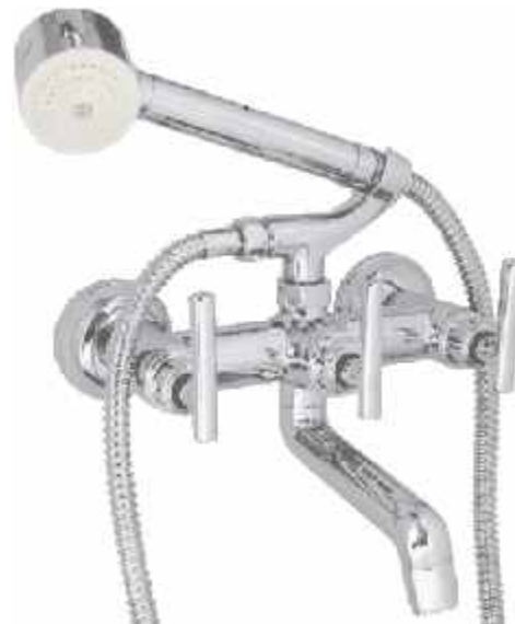
Cat No. 6253 + Cat No. 6473 Wall Mixer with Telephonic Shower Arrangement only but with Crutch + Telephonic Shower 1 & 1/2 m Long Flexible Tube