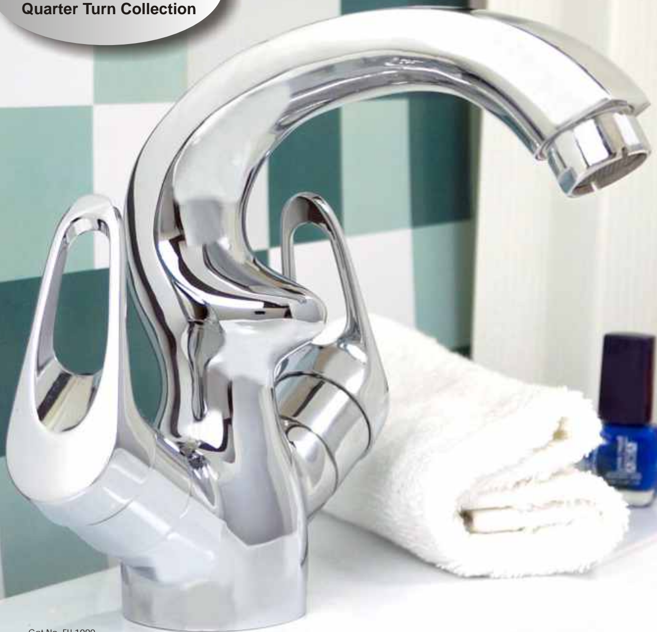
Cat No. FU 1090 Central Hole Basin Mixer