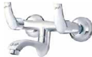
Cat No. FR 1053 C. P. Wall Mixer Non Telephonic