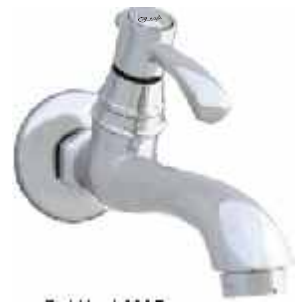
Cat No. J 1028 C. P Long Nose Bib Cock with Flange