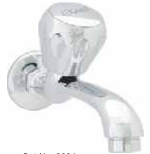
Cat No. 9034 Bib Cock Long Nose Foam Flow