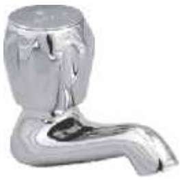
Cat No. E 1011 Pillar Cock