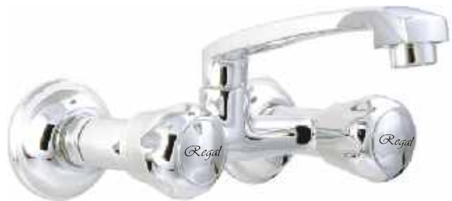
Cat No. 8305 Sink Mixer