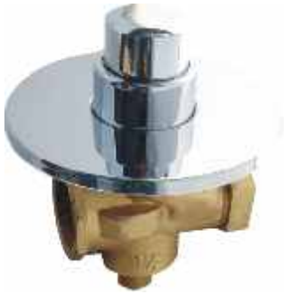
Metropole Concealed Flush Valve with Plate (621)