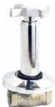
Cat No. NE 1041 Concealed Stop Cock with Sliding flange