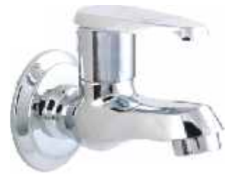
Cat No. 7032 Bib Cock with Flange