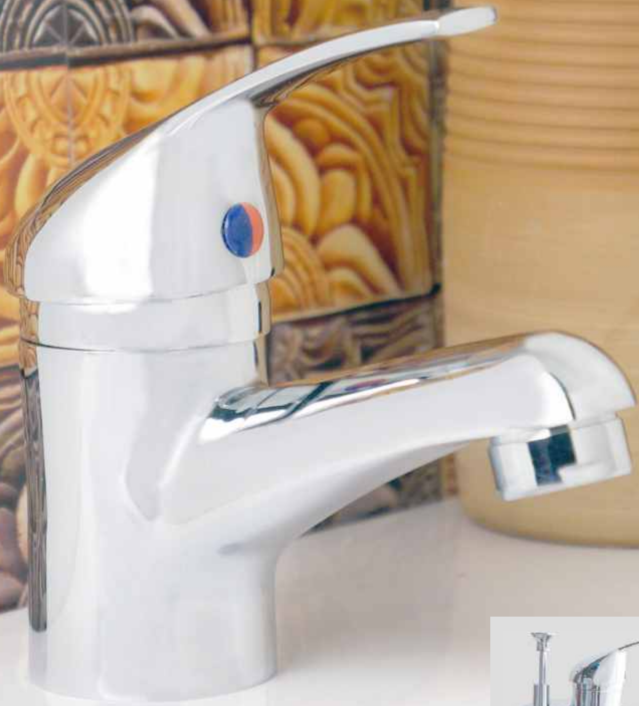
Cat No. P 1611 Single Lever Basin Mixer