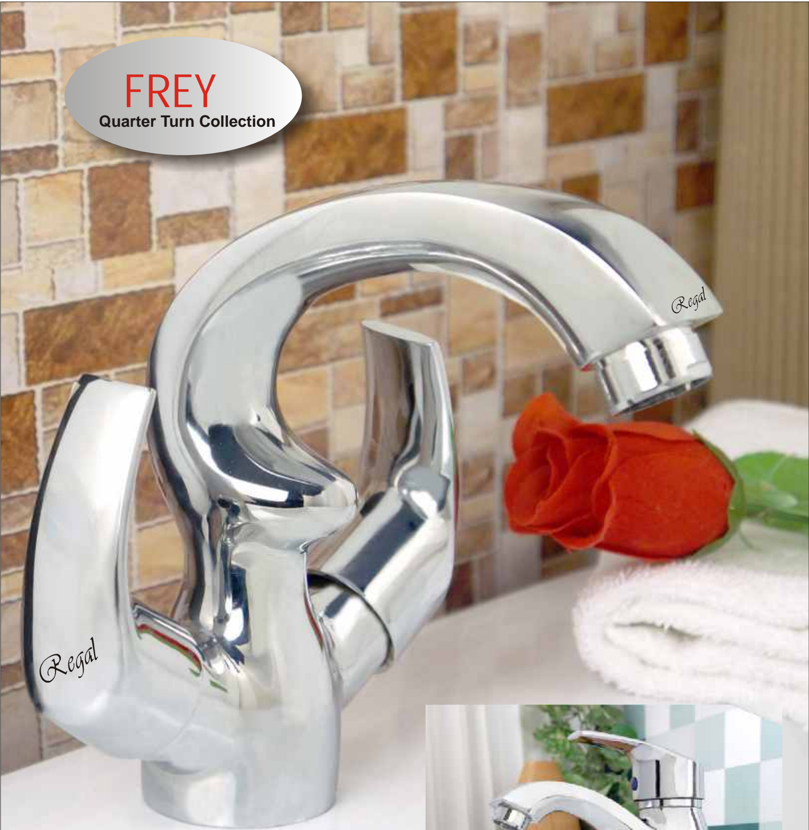
Cat No. FR 1051 C.P. Central Hole Basin Mixer