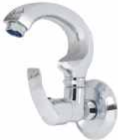
Cat No. FR 1057 Sink Cock with Swivel Spout