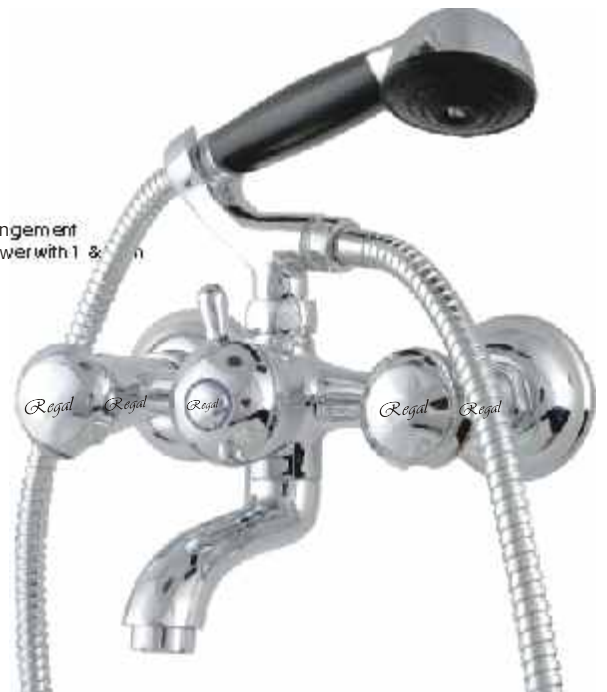
Cat No. Z 1056 + Cat No. RGL 5006 Wall Mixer with Telephonic Shower Arrangement only but with Crutch + Telephonic Shower with 1 & 2 Flexible Tube