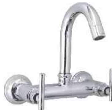
Cat No. 6305 Sink Mixer with Swivel Spout