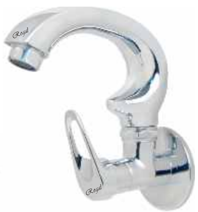
Cat No. FU 1057 Sink Cock with Swivel Spout