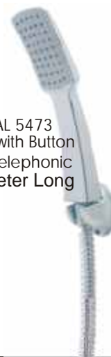
Cat No. AL 5445 + AL 5473 C.P. Bath Tub Spout with Button Attachment + C P Telephonic Shower with 1 \frac{1}{4} meter Long Flexible Tube