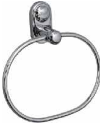
Cat No. AR 3312 Towel Ring