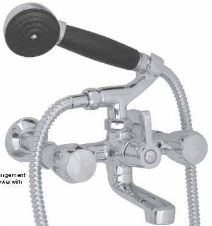
Cat No. E 1056 + Cat No. RGL 5006 Wall Mixer with Telephonic Shower Arrangement only but with Crutch + Telephonic Shower with 1 & 1/2 m Tube