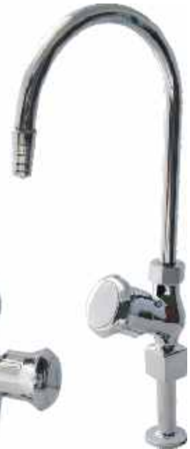
Lab Cock one way (741)