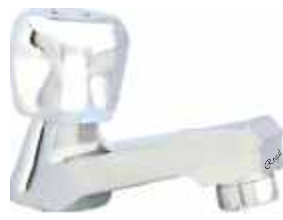
Cat No. A-11001 Pillar Cock Foam Flow