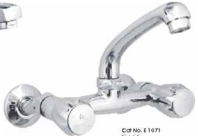
Cat No. E 1071 Sink Mixer