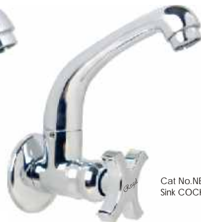
Cat No. NE 1072 Sink COCK