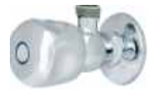
Cat No. A-11033 Angle Cock with Wall Flange