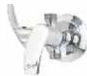
Cat No. FR 1035 C. P. Angular Stop Cock Two way