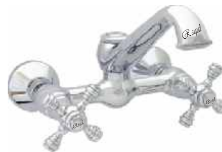
Cat No. 4307 Sink Mixer with Swivel Spout