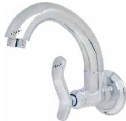
Cat No. 3345 Sink Cock with Swivel Spout