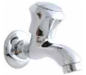
Cat No. Z 1021 Bib Cock