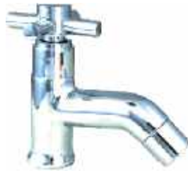
Cat No. A 1011 Pillar Cock