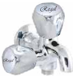
Cat No. 9038 Bib Cock Two Way