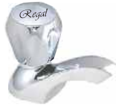
Cat No. 9011 Pillar Cock