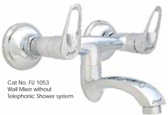
Cat No. FU 1053 Wall Mixer without Telephonic Shower system