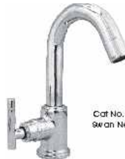
Cat No. 6041 Swan Neck Pillar Cock