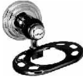
Cat No. AV 4041 Tumbler Holder