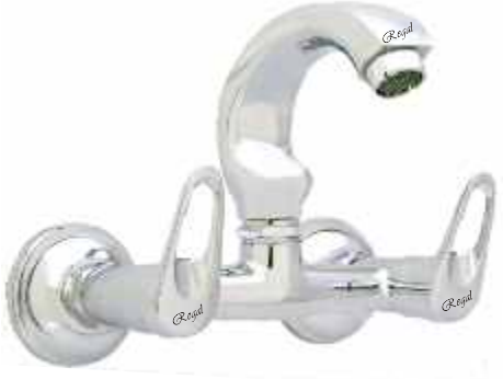
Cat No. FU 1055 Sink Mixer