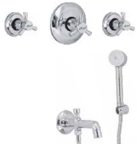
Cat No. 5462 Overhead Shower with Shower Arm, Cat No. 5081 Concealed Stop Cock with Adjustable Flange, Cat No. 5421 Four Way Divertor for Concealed Fitting with Built in Non-return Valves, Cat No. 5445 Bath Tub Spout with Button Attachment for Telephonic Shower, Cat No. 5473 Telephonic Shower Arrangement