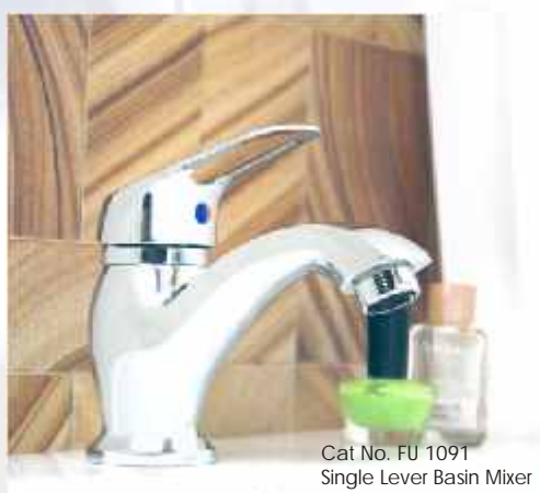
Cat No. FU 1091 Single Lever Basin Mixer