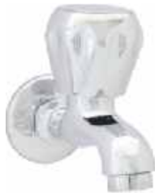
Cat No. 9033 Bib Cock Foam Flow