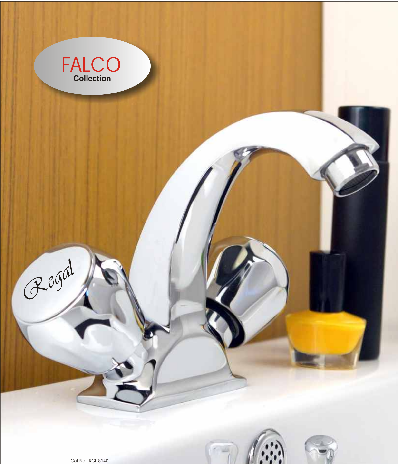
Cat No. RGL 8140 Central Hole Basin Mixer