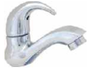
Cat No. F 1011 Pillar Cock