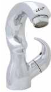
Cat No. F 1012 Pillar Cock Swan Neck