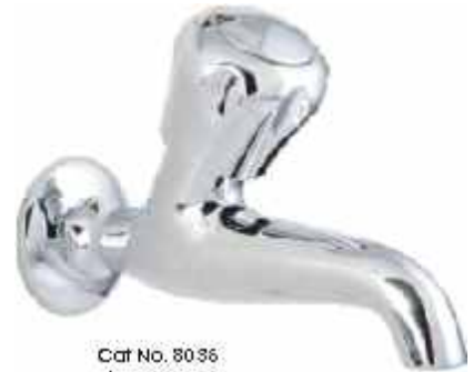
Cat No. 8036 Bib Cock Long Nose