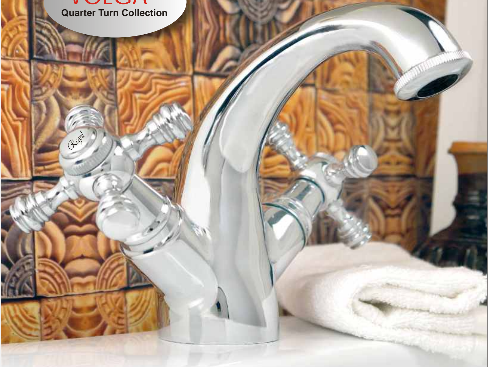
Cat No. 4141 Central Hole Basin Mixer