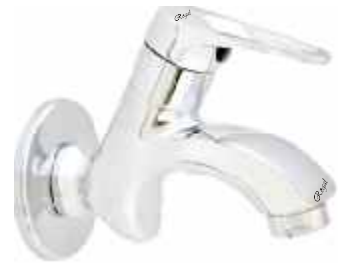
Cat No. FU 1021 Bib Cock