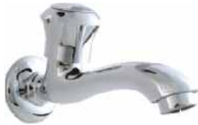
Cat No. Z 1028 Long Nose Bib Cock