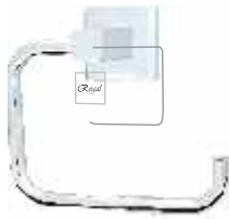
Cat No. LR 5652 C.P. Paper Holder