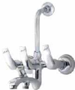
Cat No. FR 1067 C. P. Wall Mixer 3 in 1 with Bend for Overhead Shower