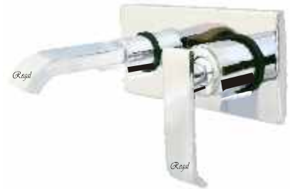
Cat No. LR 5540 C.P. Wall Mounted Basin Mixer