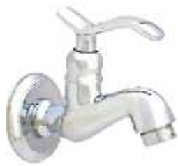
Cat No. 3032 Bib Cock with Wall Flange