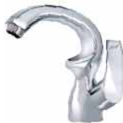
Cat No. FR 1012 C.P. Pillar Cock Swan Neck