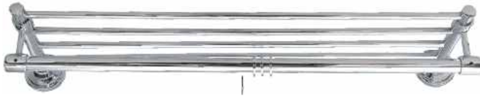
Cat No. AA 5071 Towel Rack 24"