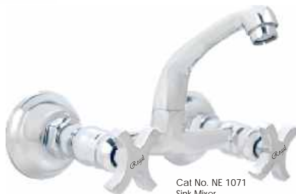
Cat No. NE 1071 Sink Mixer