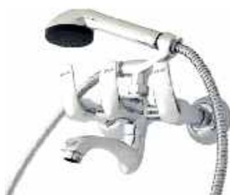
Cat No. FR 1063 + Cat No. FR 1085 C. P. Wall Mixer with Telephonic Shower Arrangement only but with Crutch + Telephonic Shower with 1 & 1/2 m long Flexible Tube