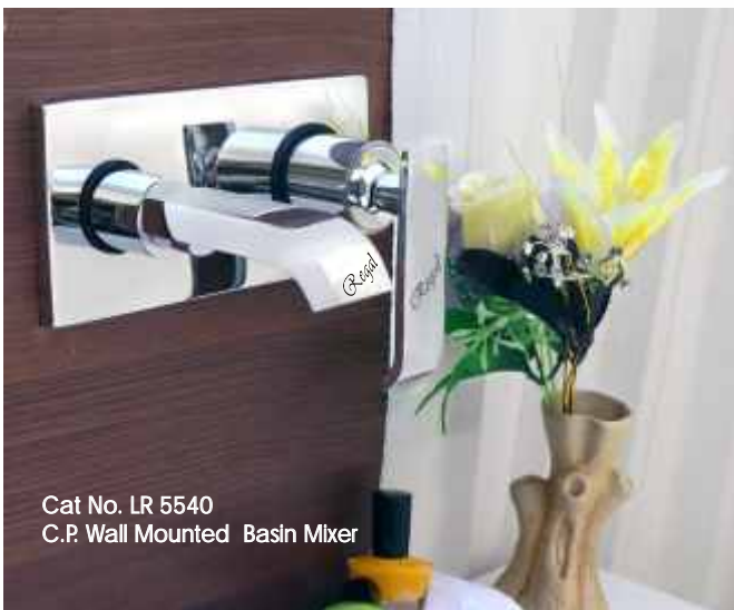
Cat No. LR 5540 C.P. Wall Mounted Basin Mixer