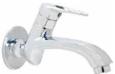
Cat No. FU 1023 Bib Cock Long Body