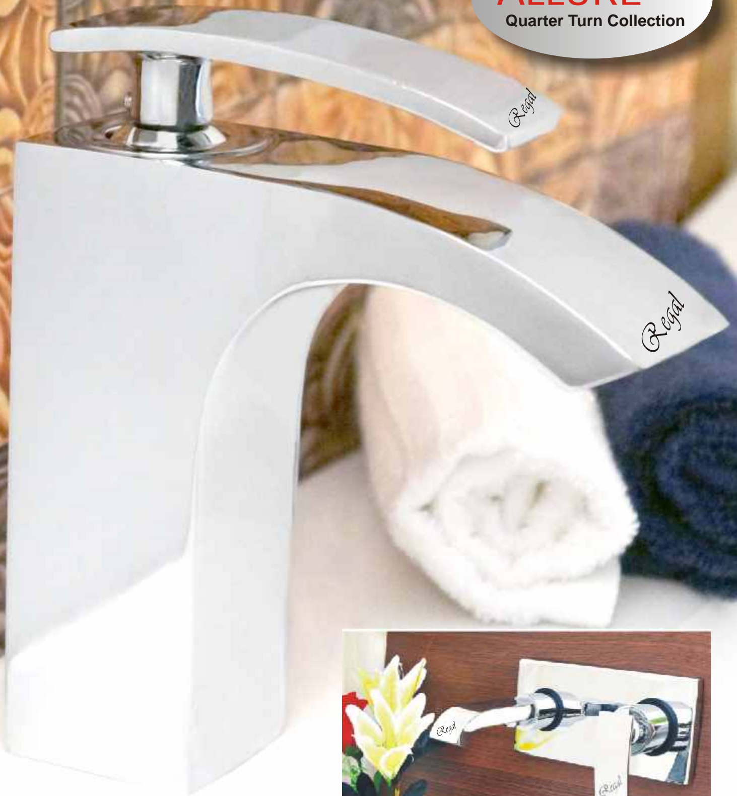
Cat No. AL 5521 C.P. Single Lever Basin Mixer