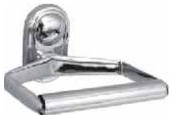
Cat No. AR 3325 Toilet Paper Holder