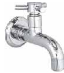
Cat No. 5032 Bib Cock with Wall Flange