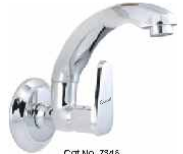
Cat No. 7345 Sink Cock with Swivel Spout