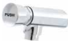
Cat No. AC 035 C.P. Bib Cock Auto Closing System