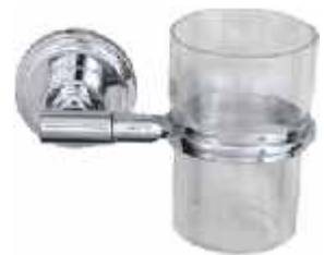
Cat No. AA 5042 Tumbler Holder Acrylic Glass