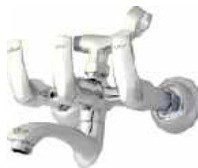
Cat No. FR 1063 C. P. Wall Mixer with Telephonic Shower Arrangement only but with Crutch