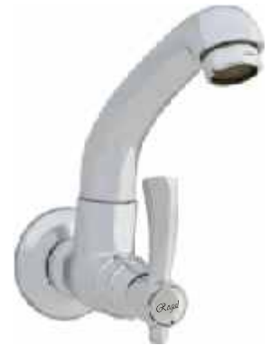
Cat No. J 1072 Sink Cock with Wall Flange