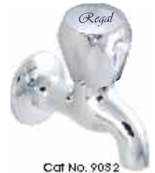
Cat No. 9032 Bib Cock