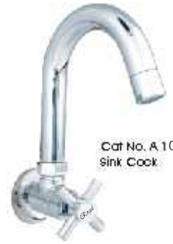
Cat No. A 1072 Sink Cock