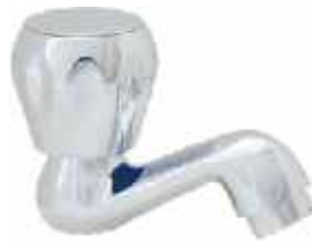
Cat No. 9015 Pillar Cock Foam Flow