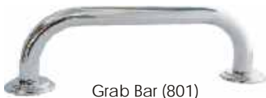
Grab Bar (801)