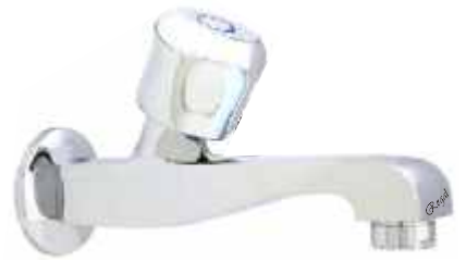
Cat No. A-110023 Long Body Bib Cock Foam Flow