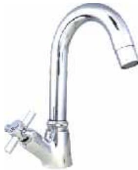
Cat No. A 1012 Pillar Cock Swan Neck with Swivel Spout