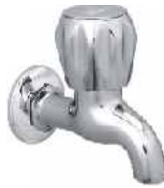
Cat No. E 1021 Bib Cock