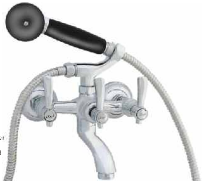
Cat No. J 1056 + RGL 5006 C. P. Wall Mixer with Telephonic Shower Arrangement only but with Crutch + Telephonic Shower with 1 & 1/2 m long Flexible Tube