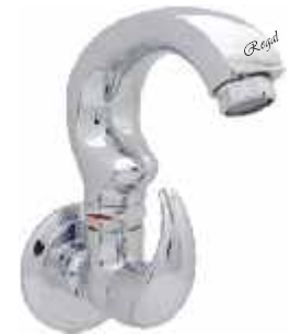
Cat No. F 1057 Sink Cock