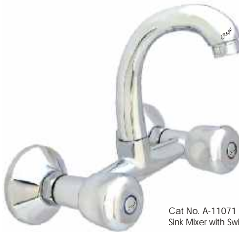
Cat No. A-11071 Sink Mixer with Swivel Spout