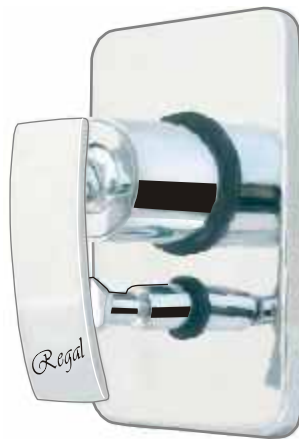
Cat No. AL 5531 C.P. Single Lever Concealed Divertor Exposed parts Kit