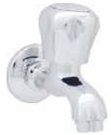
Cat No. 8033 Bib Cock Foam Flow