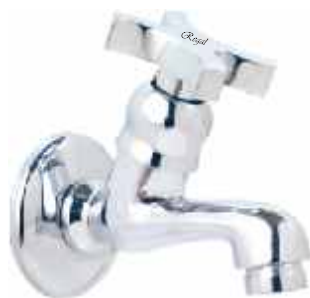
Cat No. NE 1021 Bib Cock