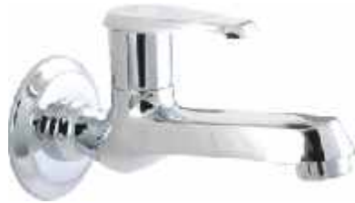
Cat No. 7035 Bib Cock Long Nose with Wall Flange