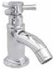
Cat No. 5011 Pillar Cock