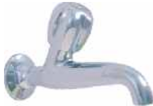
Cat No. RGL 2002 Bib Cock Long Nose