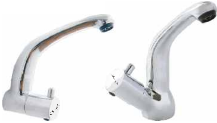
Cat No. ZI 1072 Sink Cock