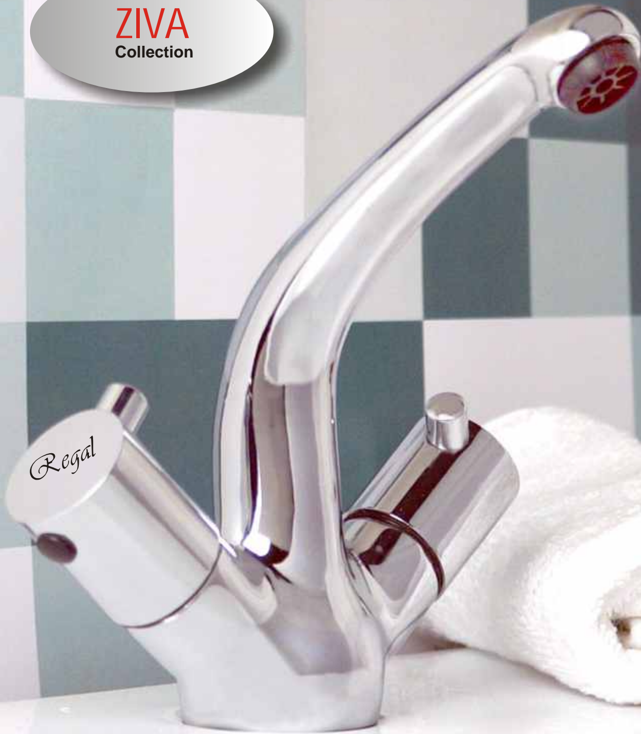
Cat No. ZI 1061 Central Hole Basin Mixer