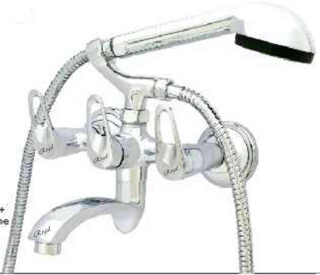
Cat No. FU 1063 + Cat No. FU 1085 Wall Mixer with Telephonic Shower Arrangement only but with Crutch + Telephonic Shower with 1 & 1/2 m Tube