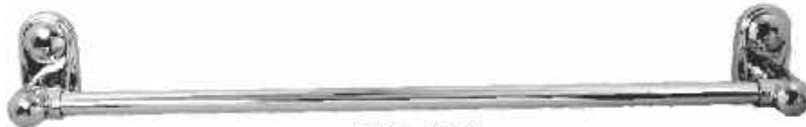
Cat No. AR 3301 Towel Rail 24"