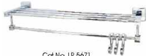
Cat No. LR 5671 C.P. Towel Rack 24"