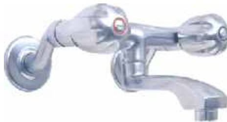
Cat No. RGL 4002 Wall Mixer (Non-Telephonic)