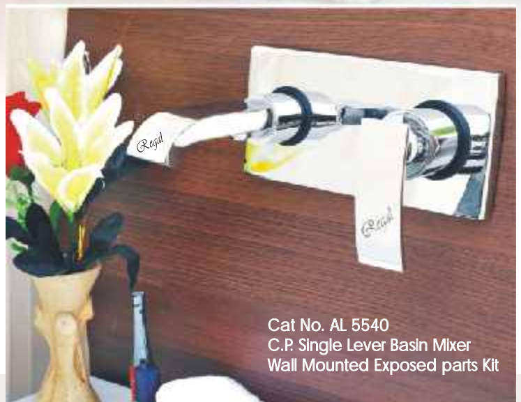
Cat No. AL 5540 C.P. Single Lever Basin Mixer Wall Mounted Exposed parts Kit