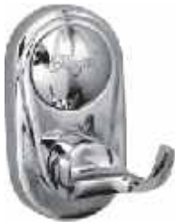
Cat No. AR 3317 Robe Hook