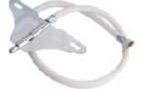
Jet Spray with 1 mtr. tube (651)