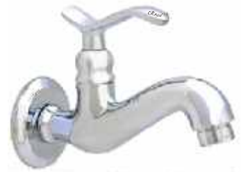
Cat No. 3035 Bib Cock Long Nose with Wall Flange