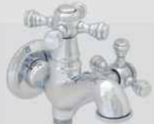
Cat No. 4038 Bib Cock Two way