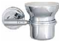
Cat No. AA 5041 Tumbler Holder with Brass Glass