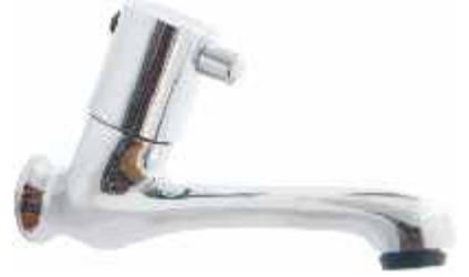
Cat No. ZI 1028 Long Nose Bib Cock