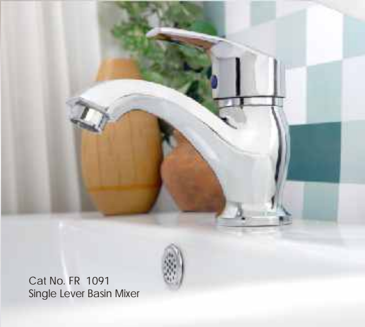
Cat No. FR 1091 Single Lever Basin Mixer