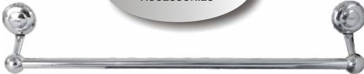
Cat No. E 1091 Towel Rail 24"