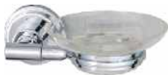
Cat No. AA 5032 Soap Dish Acrylic