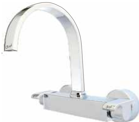
Cat No. LR 5305 C.P. Sink Mixer