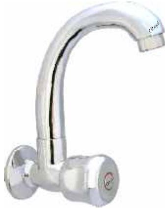
Cat No. A-11035 Sink Cock with Wall Flange