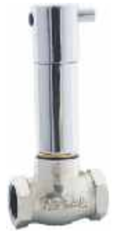
Cat No. ZI 1041 Concealed Stop Cock with Sliding Flange 15 mm