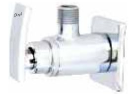
Cat No. AL 5050 C.P. Angle Cock