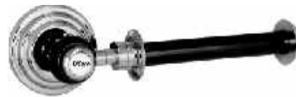
Cat No. AV 4051 Toilet Paper Holder