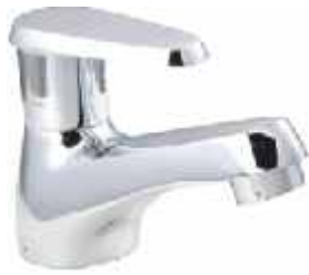
Cat No. 7011 Pillar Cock