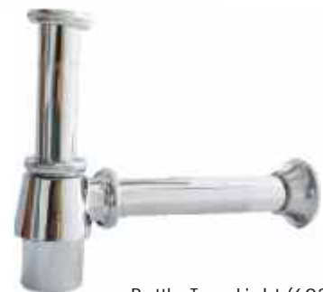
Bottle Trap Light (603)