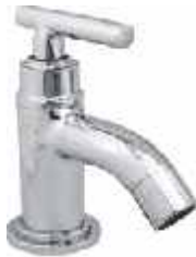
Cat No. 6011 Pillar Cock