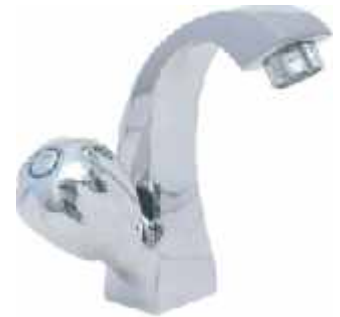
Cat No. RGL 1003 Swan Neck Pillar Cock