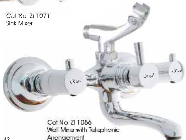
Cat No. ZI 1056 Wall Mixer with Telephonic Arrangement