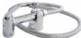
Health Faucet with 1mtr. flexible tube with wall hook (635)