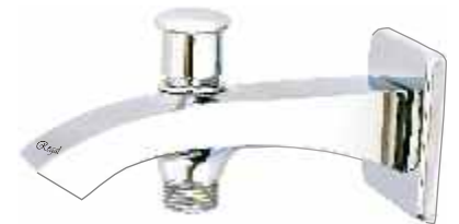
Cat No. AL 5445 C.P. Bath Tub Spout with Button Attachment for Telephonic Shower