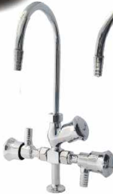
Lab Cock three way (742)