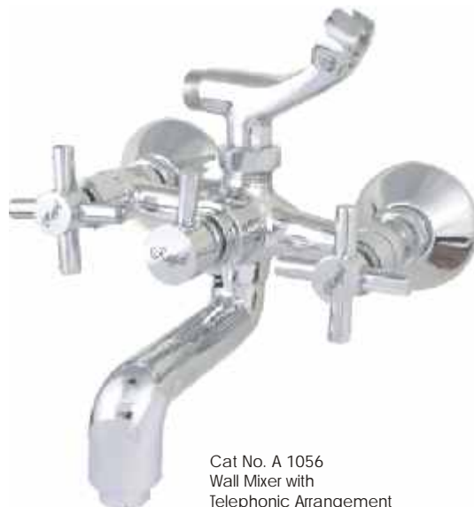
Cat No. A 1056 Wall Mixer with Telephonic Arrangement