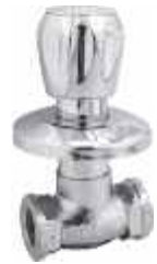
Cat No. E 1041 Concealed Stop Cock with Sliding Flange