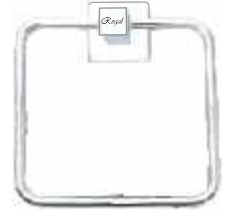
Cat No. LR 5621 C.P. Towel Ring