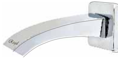
Cat No. AL 5428 C.P. Bath Tub Spout Wall Flange