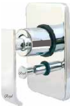
Cat No. LR 5531A C.P. Single Lever Concealed Divertor Exposed parts Kit