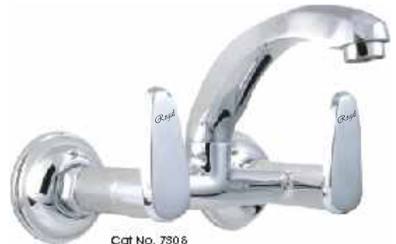
Cat No. 7306 Sink Mixer with Swivel Spout