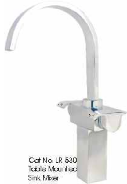
Cat No. LR 530 Table Mounted Sink Mixer