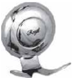
Cat No. E 1095 Robe Hook