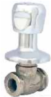
Cat No. A-11053 Concealed Stop Cock with Sliding Flange