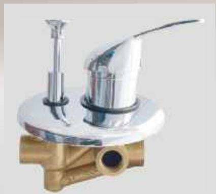
Cat No. P 1612 Single Lever Concealed Diverter