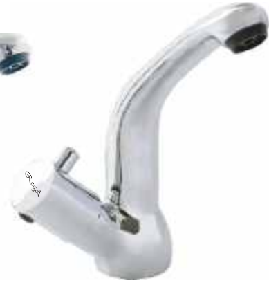
Cat No. ZI 1012 Pillar Cock Swan Neck