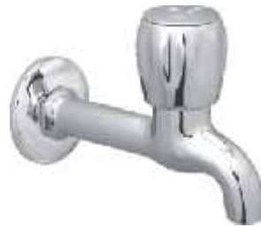
Cat No. E 1027 Long Body Bib Cock