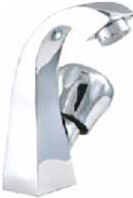
Cat No. 8013 Pillar Cock Swan Neck