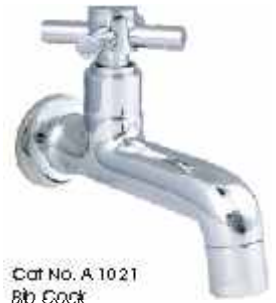
Cat No. A 1021 Bib Cock