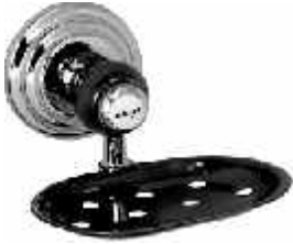
Cat No. AV 4031 Soap Dish