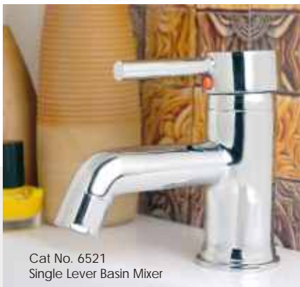
Cat No. 6521 Single Lever Basin Mixer