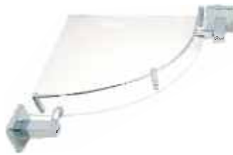
Cat No. LR 5691 C.P. Acrylic Corner