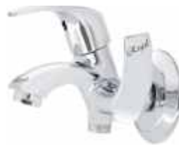
Cat No. FR 1025 C. P. Bib Cock Two Way