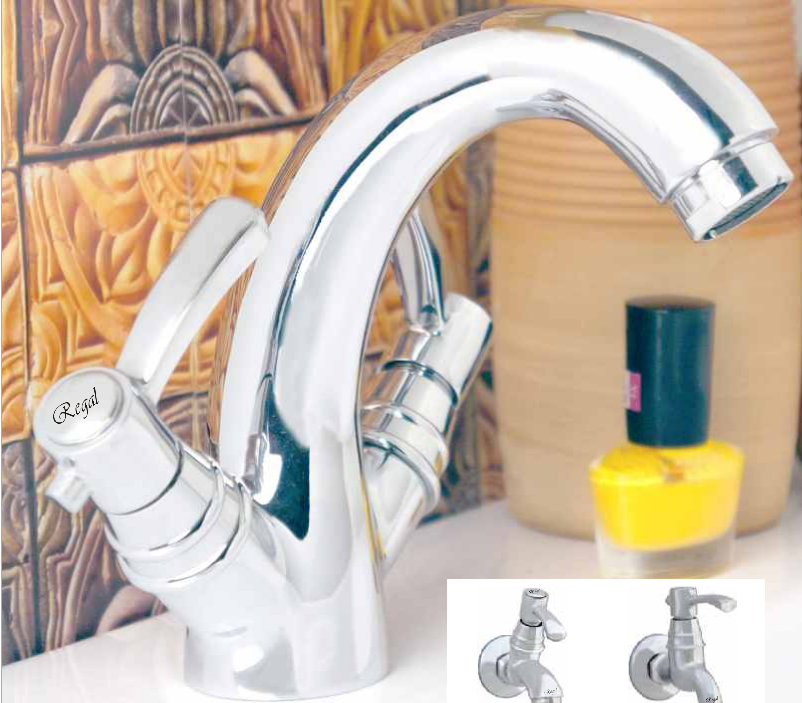
Cat No. J 1061 Central Hole Basin Mixer