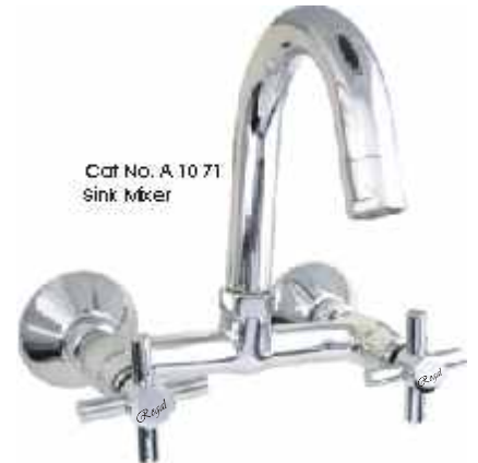
Cat No. A 1071 Sink Mixer