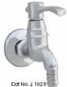
Cat No. J 1023 C.P. Bib Cock Hose Connection