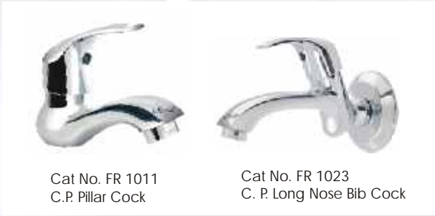
Cat No. FR 1011 C.P. Pillar Cock