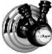
Cat No. AV 4035 Robe Hook