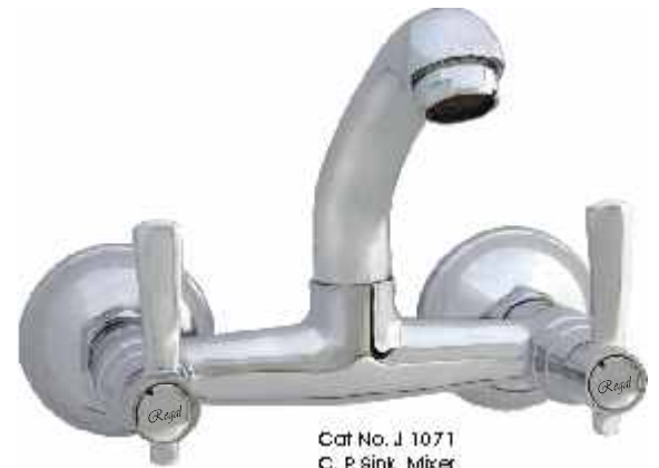
Cat No. J 1071 C. P Sink Mixer