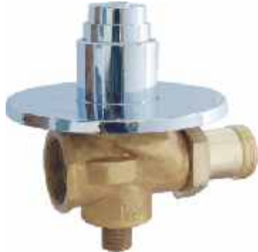
Metropole Concealed Flush Valve Dual with round Plate (622A)