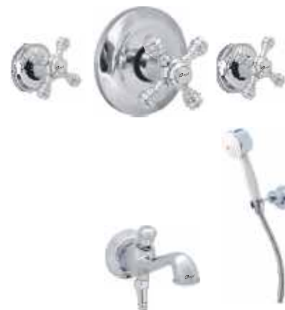
Cat No. 4421 + Cat No. 4447 + Cat No. 4081 + Cat No. 4465 + Cat No. 4515 4 Way Divertor for Concealed Fitting with Built in Non return Valves Bath Tub Spout with Button attachment for Telephone Shower Concealed Stop Cock with Adjustable Flange Overhead Shower with revolving joint and Long Swivel Shower Arm Telephonic Shower with 1m Long Flexible Tube & Swivel Lock