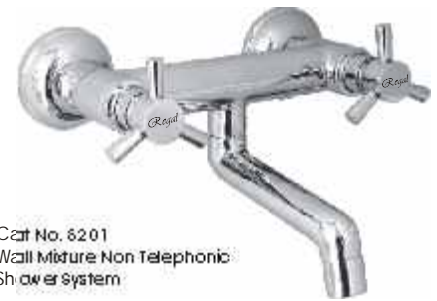
Cat No. 6201 Wall Mixture Non Telephonic Shower System