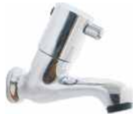
Cat No. ZI 1021 Bib Cock