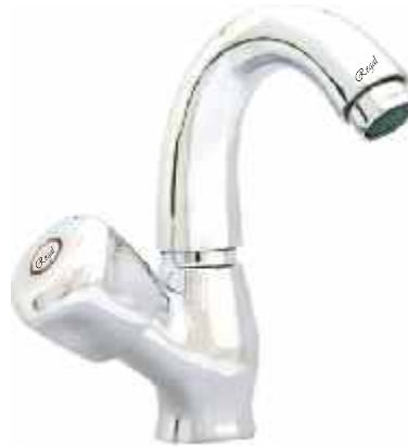
Cat No. A-11003 Pillar Cock Swan Neck