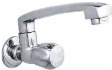
Cat No. E 1072 Sink Cock