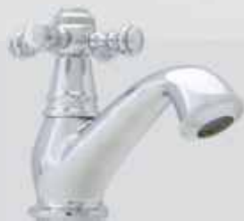
Cat No. 4001 Pillar Cock