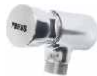
Cat No. AC 045 C.P. Angle Cock Auto Closing System