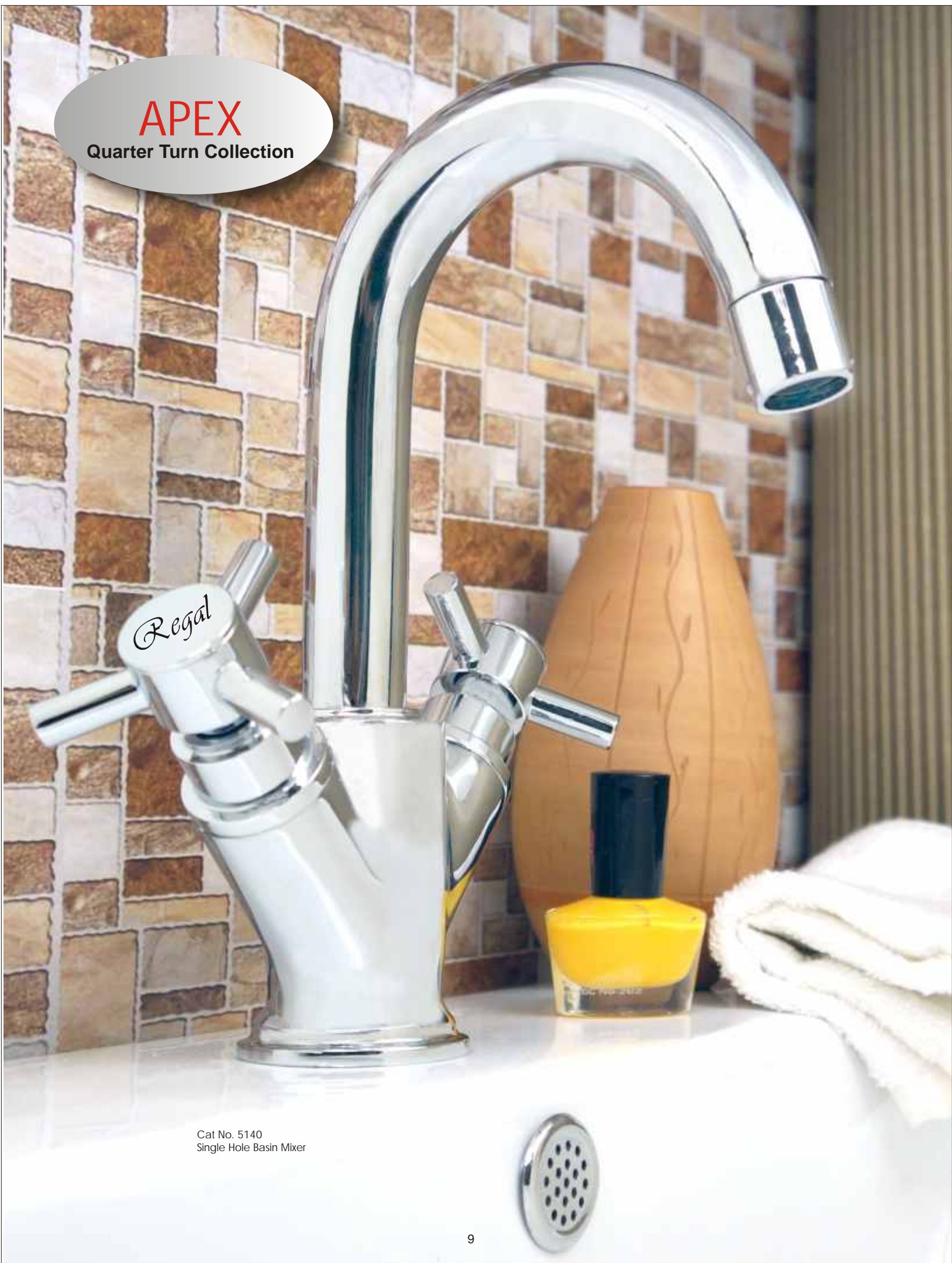
Cat No. 5140 Single Hole Basin Mixer