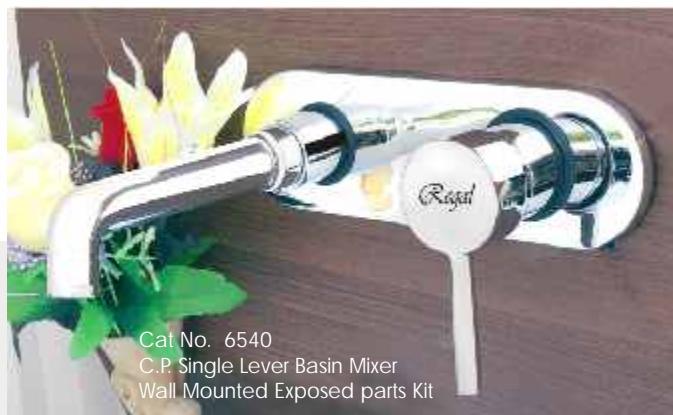
Cat No. 6540 C.P. Single Lever Basin Mixer Wall Mounted Exposed parts Kit