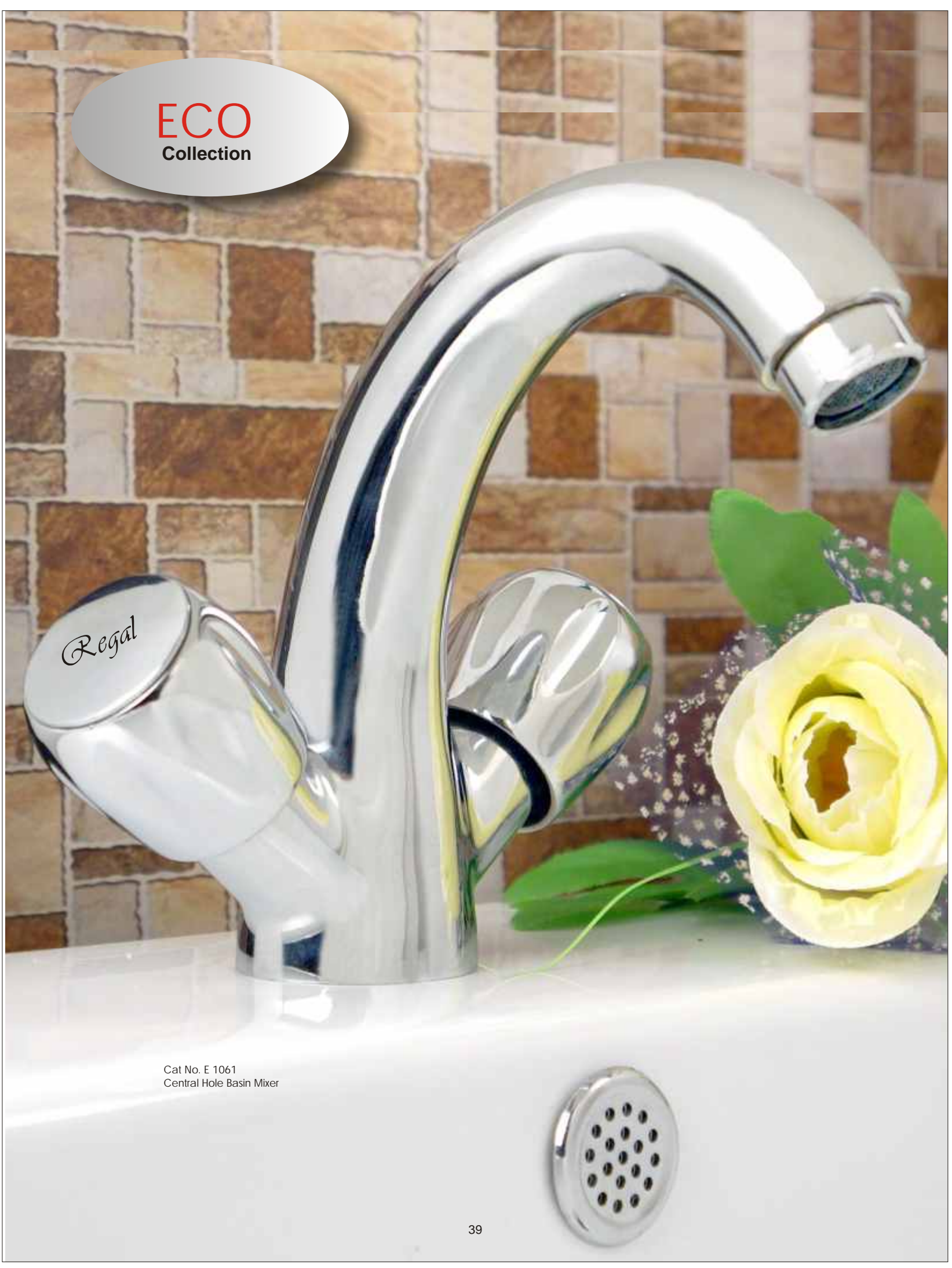
Cat No. E 1061 Central Hole Basin Mixer