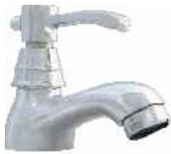
Cat No. J 1011 C.P. Pillar Cock