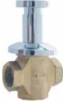
RGL 7001 Flush Cock Push type 1"