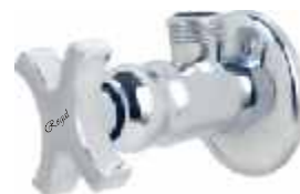
Cat No. NE 1031 Angle Cock