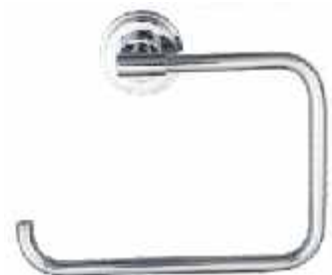
Cat No. AA 5021 Towel Ring