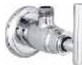
Cat No. 6050 Angular Stop Cock with Wall Flange