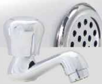
Cat No. 8015 Pillar Cock Foam Flow