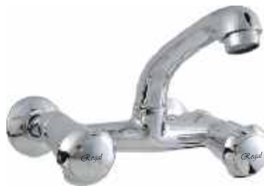
Cat No. Z 1071 Sink Mixer