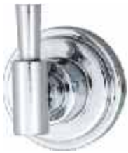
Cat No. AA 5035 Robe Hook