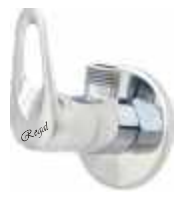
Cat No. FU 1031 Angular Stop Cock with Wall Flange