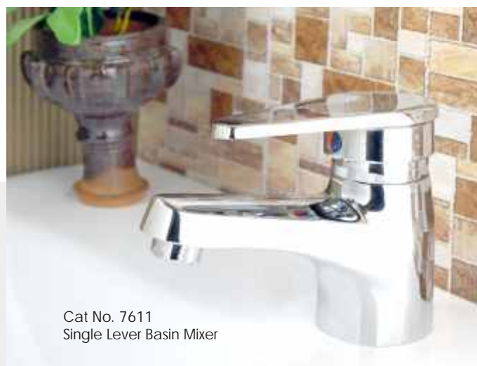
Cat No. 7611 Single Lever Basin Mixer