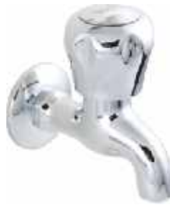
Cat No. 8032 Bib Cock