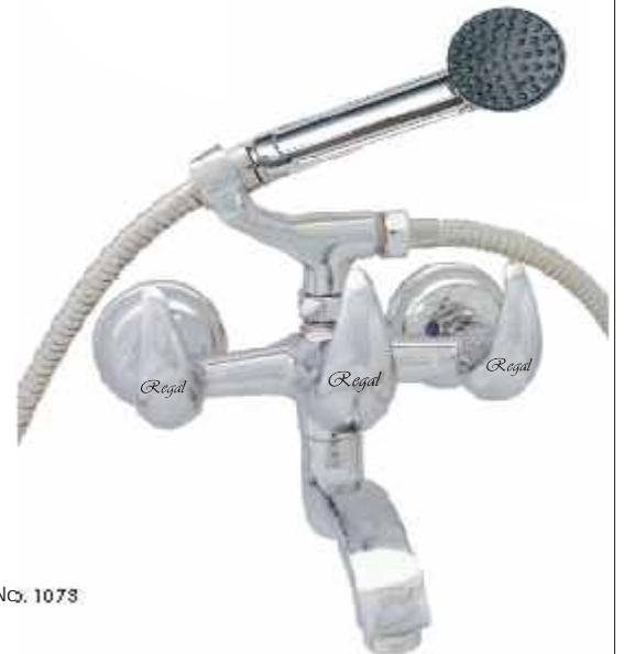
Cat No. F 1081 + Cat No. F 1101 + Cat No. 1085 + Cat No. 1073 Overhead Shower with Shower Arm Single Lever Concealed Divertor for Bath & Shower System Telephonic Shower with 1 m Long Flexible Tube Bath Tub Spout with Button attachment for Telephonic Shower