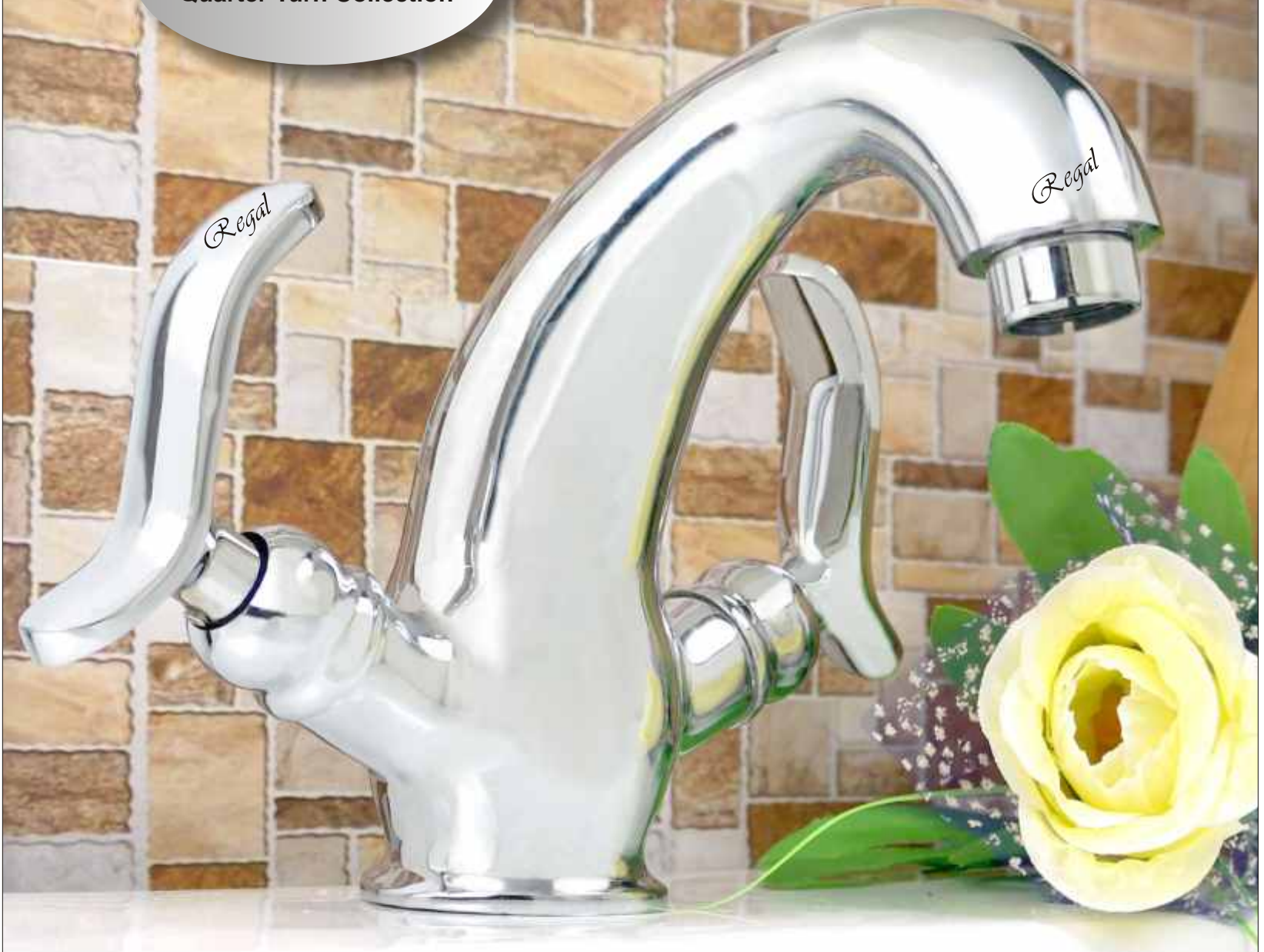
Cat No. 3140 Central Hole Basin Mixer