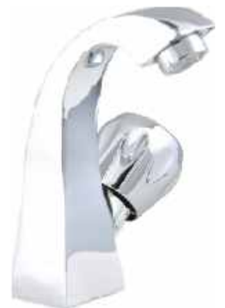
Cat No. 9013 Pillar Cock Swan Neck