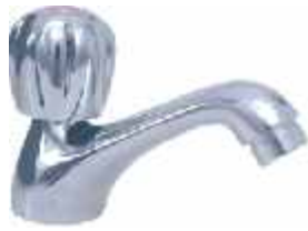
Cat No. RGL 1004 Pillar Cock Super