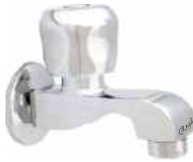
Cat No. A-110021 Bib Cock Foam Flow