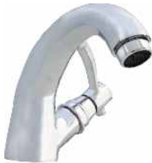
Cat No. J 1012 C.P. Pillar Cock Swan Neck