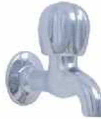
Cat No. RGL 2001 Bib Cock