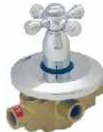
Cat No. 4421 Four Way Divertor for Concealed Fitting with built in non-return valve