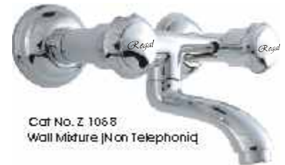
Cat No. Z 1068 Wall Mixture (Non Telephonic)