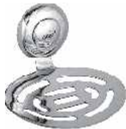
Cat No. E 1092 Soap Dish