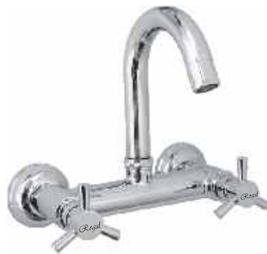
Cat No. 5305 Sink Mixer with Swivel Spout