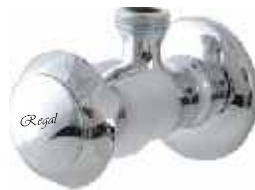
Cat No. Z 1031 Angle Cock