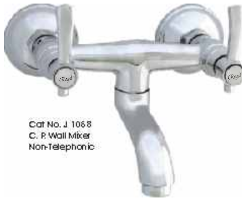
Cat No. J 1068 C. P Wall Mixer Non-Telephonic