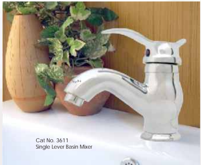
Cat No. 3611 Single Lever Basin Mixer