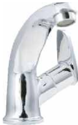
Cat No. 7041 Swan Neck Pillar Cock