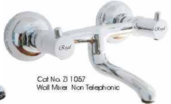
Cat No. ZI 1057 Wall Mixer Non Telephonic