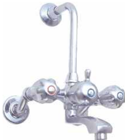
Cat No. RGL 5022 Shower Delite with Arm Cat No. RGL 4013 Wall Mixer with Bend