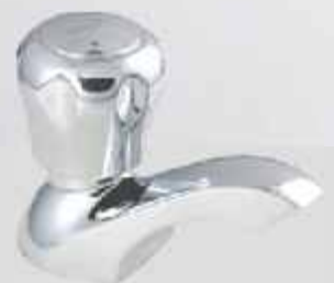
Cat No. 8011 Pillar Cock