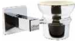
Cat No. LR 5641 C.P. Tumbler Holder