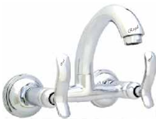
Cat No. 3305 Sink Mixer with Swivel Spout