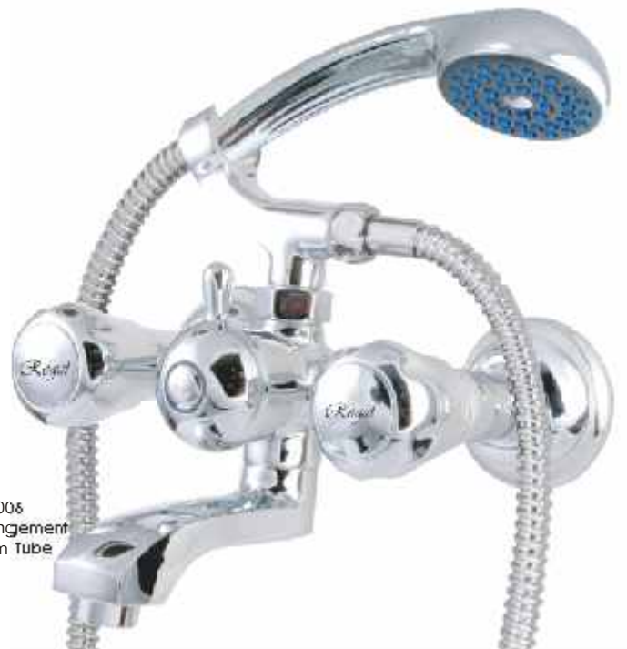
Cat No.8253 + Cat No. RGL 5008 Wall Mixer with Telephonic Arrangement Telephonic Shower with 1 & 1/2m Tube