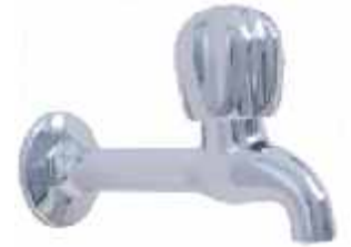
Cat No. RGL 2003 Bib Cock Long Body