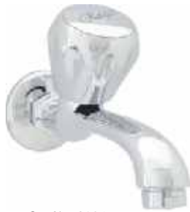
Cat No. 8034 Bib Cock Long Nose Foam Flow