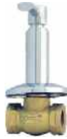
Cat No. J 1041 C.P. Concealed Stop Cock with Sliding Flange 15 mm