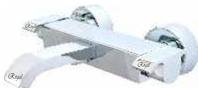
Cat No. LR 5201 C.P. Wall Mixer Non Telephonic Shower System