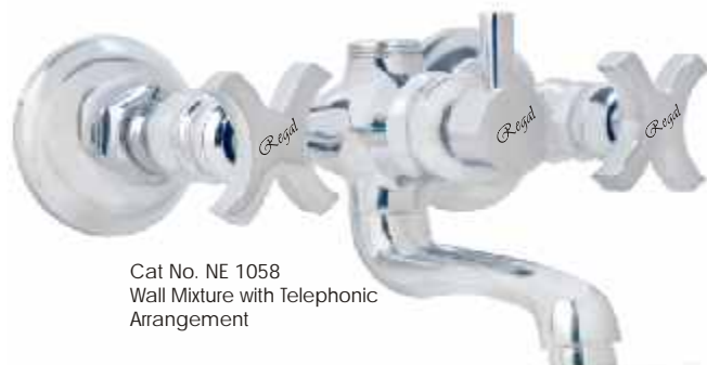
Cat No. NE 1058 Wall Mixture with Telephonic Arrangement