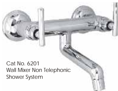
Cat No. 6201 Wall Mixer Non Telephonic Shower System