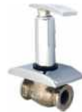
Cat No. AL 5081 C.P. Concealed Stop Cock with Adjustable Flange