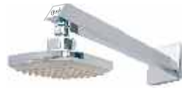
Cat No. LR 5462 + LR 5463 C.P. Overhead Shower + C.P. Shower Arm 14"