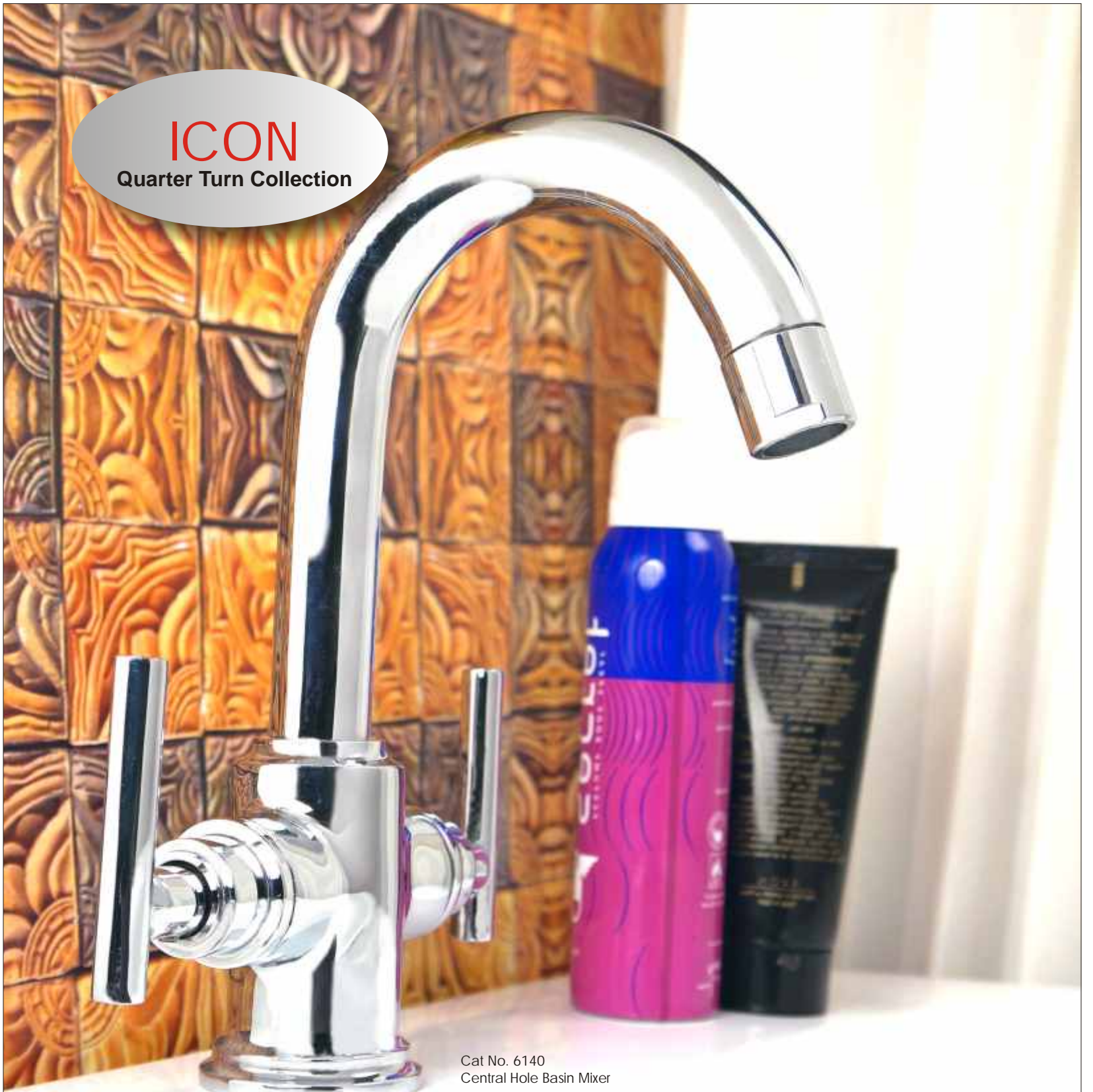
Cat No. 6140 Central Hole Basin Mixer