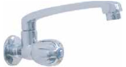
Cat No. RGL 3051 Sink Cock with Swinging Spout