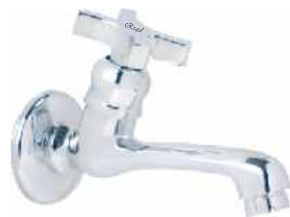
Cat No. NE 1028 Long Nose Bib Cock