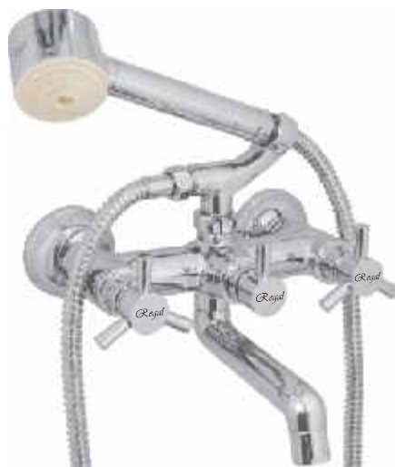
Cat No. 5253 + Cat No. 5473 Wall Mixer with Telephonic Shower Arrangement only but with Crutch + Telephonic Shower with 1 & 1/2 m Flexible Tube