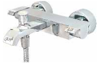
Cat No. LR 5272 C.P. Wall Mixer with Button Spout