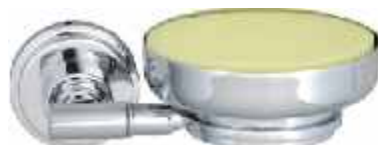
Cat No. AA 5031 Soap Dish