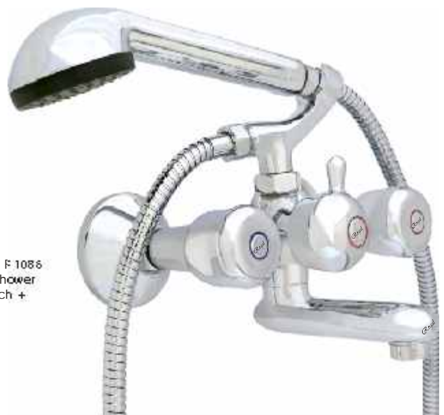
Cat No. A-11076 + Cat No. F 108.8 Wall Mixer with Telephonic Shower Arrangement only with Crutch + Flexible Tube 1 & 1/2 m.