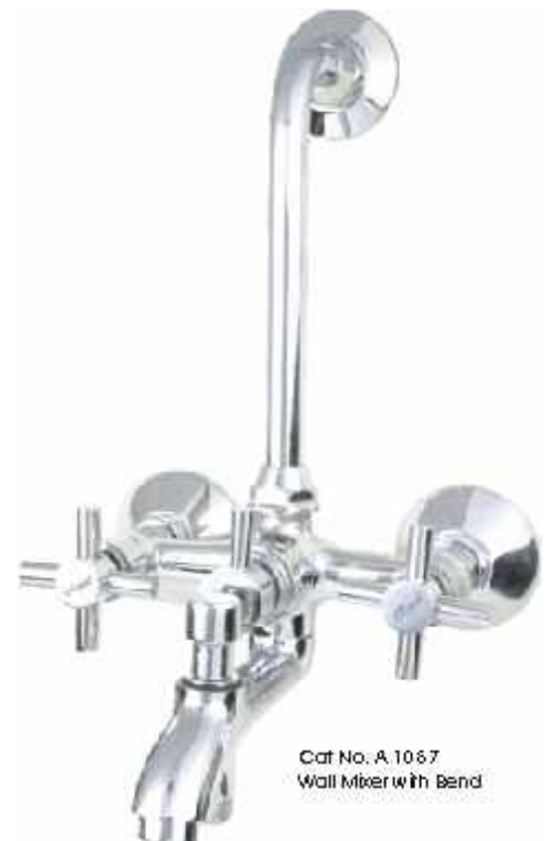
Cat No. A 1067 Wall Mixer with Bend