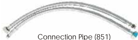
Connection Pipe (851)