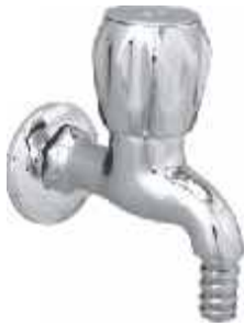
Cat No. E 1025 Bib Cock Hose Connection