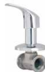
Cat No. FR 1045 C.P. Concealed Stop Cock with Sliding Flange(Light) 15mm