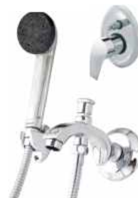
Cat No. FR 1073 + Cat No. FR 1111A + Cat No. FR 1081+ FR 1085 C. P. Telephonic Shower 1.5 m long Flexible Tube 3 inlet Single Lever concealed Divertor exposed parts kit Bath Tub Spout with button attachment + Overhead Shower