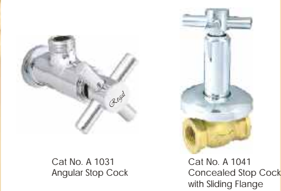
Cat No. A 1031 Angular Stop Cock