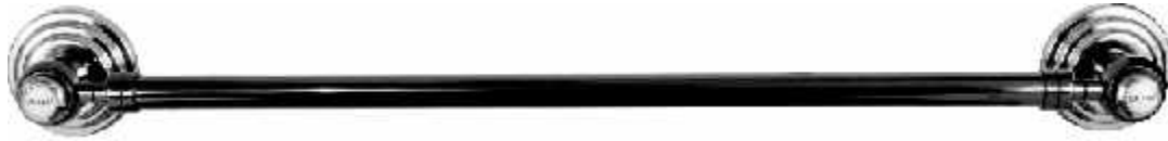
Cat No. AV 4011 Towel Rail 24"