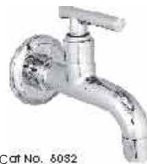
Cat No. 6032 Bib Cock with Wall Flange