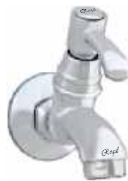
Cat No. J 1021 C.P. Bib Cock