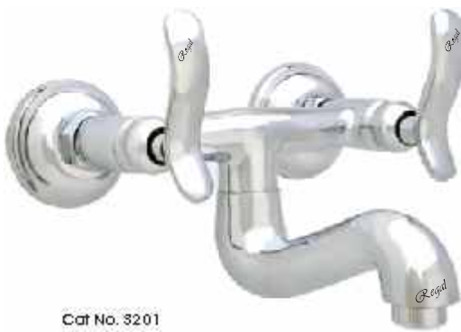
Cat No. 3201 Wall Mixer Non Telephonic Shower System