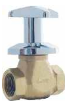
RGL 7003 Flush Cock Cross Type Handle 1"