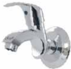
Cat No. FR 1021 C.P. Bib Cock