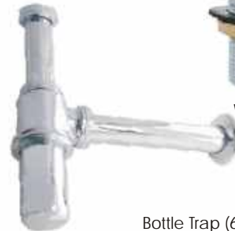
Bottle Trap (601)