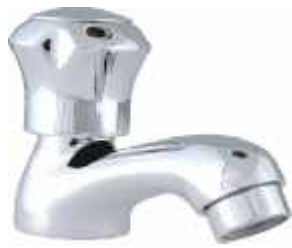
Cat No. Z 1011 Pillar Cock