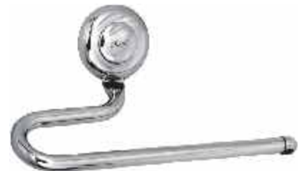
Cat No. E 1094 Towel Ring