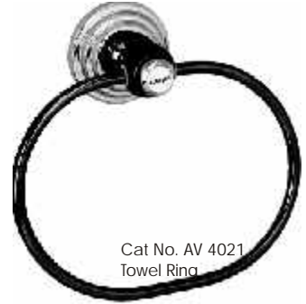
Cat No. AV 4021 Towel Ring