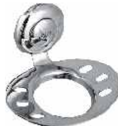
Cat No. E 1093 Tumbler Holder