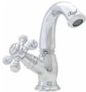
Cat No. 4002 Pillar Cock Swan Neck