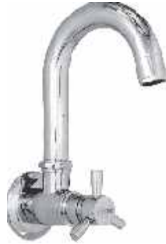
Cat No. 5345 Sink Cock with Swivel Spout