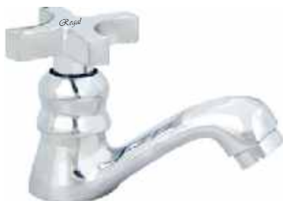
Cat No. NE 1011 Pillar Cock