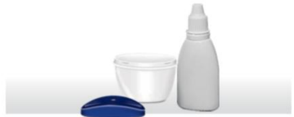
ULTRA PETROLEUM JELLY, EYEDROP