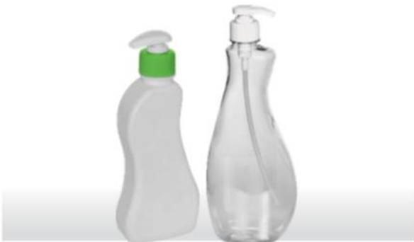
ULTRA HAND WASH