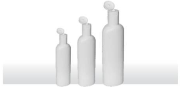
ULTRA COSMO BOTTLE