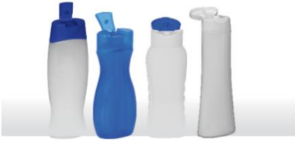
ULTRA PEAR/LOTION/MAZE TOWER BOTTLE