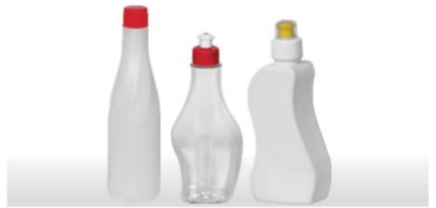
ULTRA KETCHUP & DISHWASH