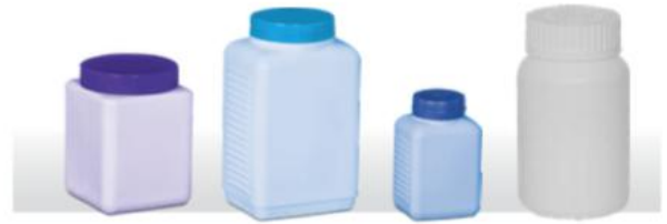
ULTRA TABLET JARS