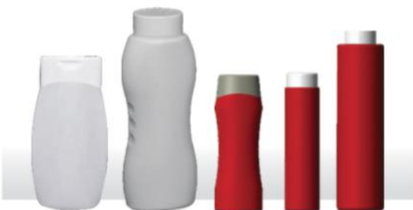
ULTRA POWDER BOTTLE