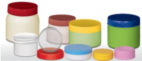
ULTRA CREAM JARS