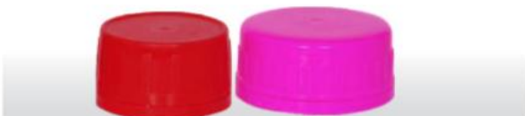
ULTRA PHENYL CAP