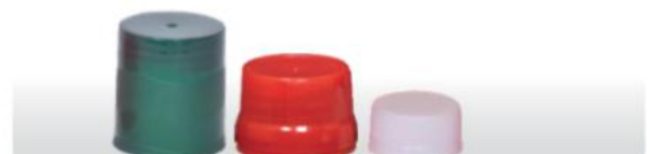
ULTRA PILFER PROOF (BMW)